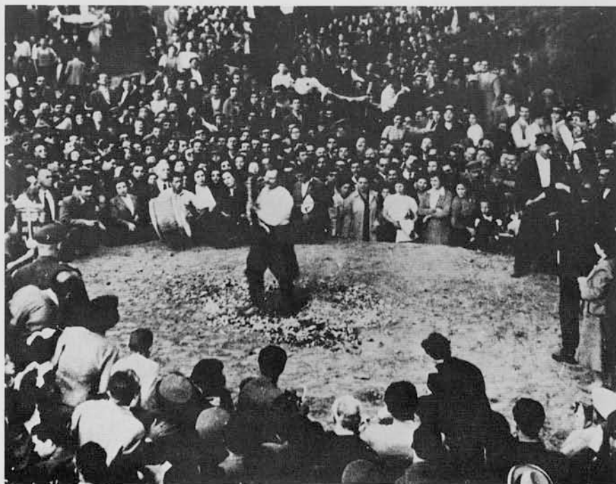
1 Greek firewalker carrying an icon.

By unanimous consent the icons became the private property of the rescuers, who have handed them down from one generation to the next ever since. Descendants of the rescuers vowed that on each anniversary of the fire they would honor St. Constantine and his mother Helen by walking barefoot through fire, believing firmly that they would escape being burned if they were steadfast in their faith. So, on May 21, 1975, a ceremony which has had an uninterrupted history of over seven hundred years was once more performed.