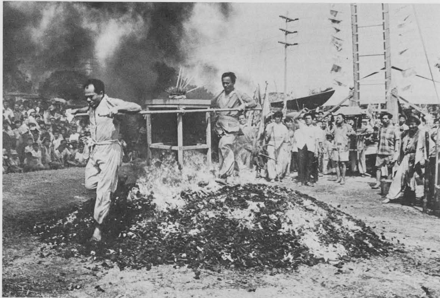
Firewalking in Thailand.