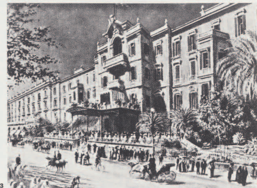
3 Shepherd's Hotel in Cairo