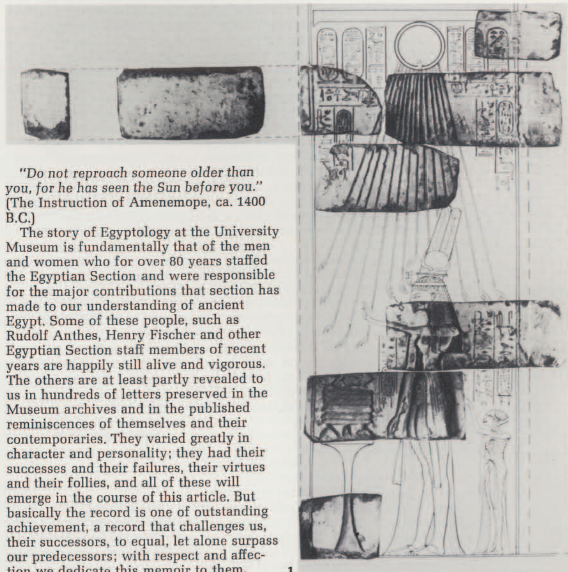
1 The Sun-disc of ancient Egypt: blocks from the Akhenaten Temple Project

"Do not reproach someone older than you, for he has seen the Sun before you." (The Instruction of Amenemope, ca. 1400 B.C.)