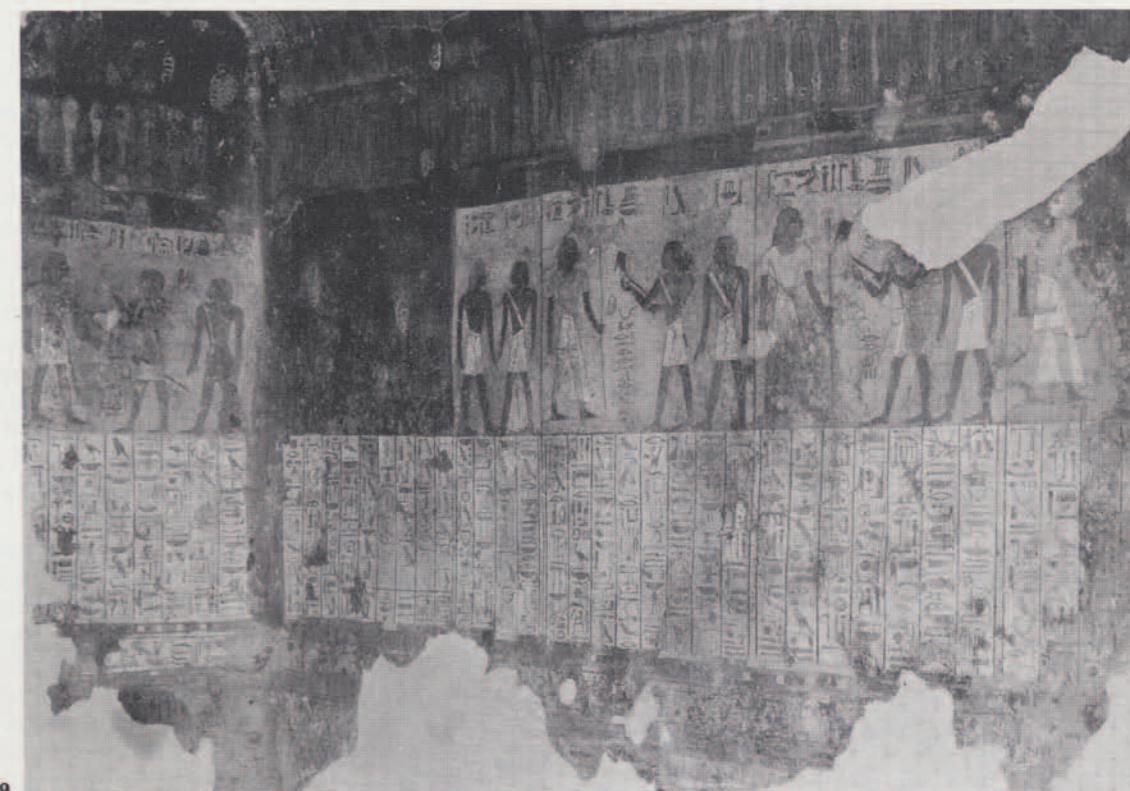
Partially cleaned walls of the tomb of Bekhenkhons