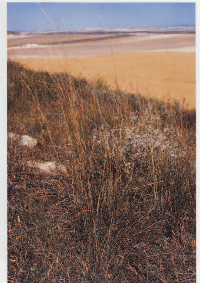
Fig. 3 (right). The inspiration for the Midas Mound conservation and revegetation project came after a visit to this small patch of (then) relatively undisturbed grassy steppe. Surrounded by dry-farmed fields and lying about 5 kilometers from the nearest village, the naturally high diversity of plants was able to grow here.

ing the plant cover would be an effective way to reduce erosion. Plant cover would keep the strong Anatolian winds from blowing soil away, would diminish the force of water reaching the soil surface, and underground, the roots would reduce the total volume of water reaching the bottom of the mound by absorbing rainwater. This approach would not solve all the problems, because the steep slope of the mound naturally limits plant growth. Also, the mound is the high point of the village, which makes climbing it almost irresistible to local young people and tourists.