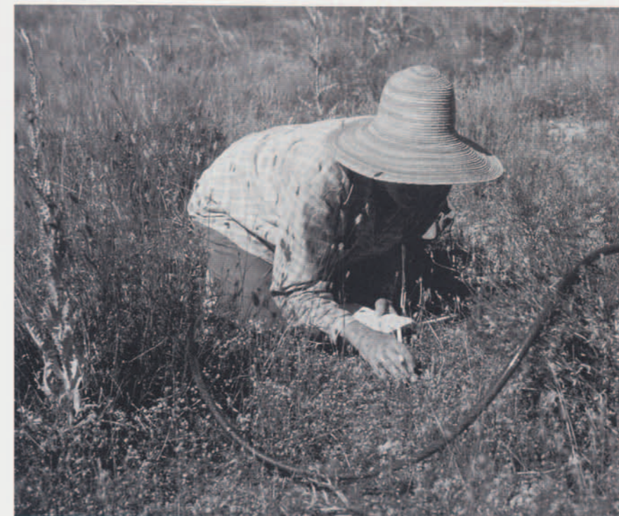
Fig. 8. Part of our conservation efforts involves gathering information as the project evolves. Here, I am in the midst of censusing plants on the Midas Tumulus; every 10 meters along a transect, I identify all the plant types growing in one square meter (the area encircled by the 3.54 m length of garden hose).

At Gordion, we used a pump-driven flotation device to extract and concentrate the tiny bits of charred seeds and wood from samples of the archaeological deposits. Here I am pouring a bucket of dirt into the tank while my assistant adjusts the water level. As the water flows up and out of the tank, charred seeds and wood bits are caught in a cloth. After they dry, they are examined at low-magnification under a light microscope. Changes through time in the proportions of different types help us interpret corresponding changes in ancient vegetation and land use.