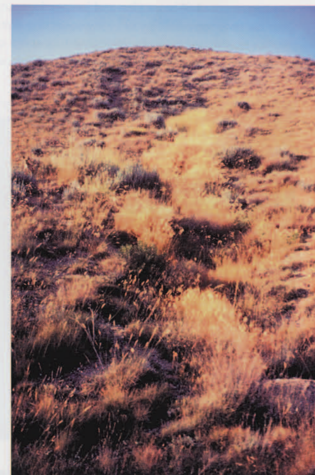
Fig. 7 (right). After two growing seasons, the annual grasses continue to thrive in the bed of the erosion channel. Even better, some of the perennial grasses and other plants that grow on the mound have been able to take advantage of the stabilized soil surface and have spread to the channel.