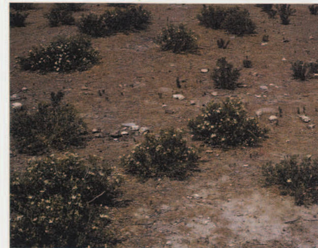
Fig. 2 (top). An overgrazed area at Gordion shows patches of Peganum harmala (wild rue). The flocks avoid Peganum , because the leaves contain a bitter alkaloid (harmaline), but have eaten almost everything growing between the plants.

In the short term, maintaining and expand-