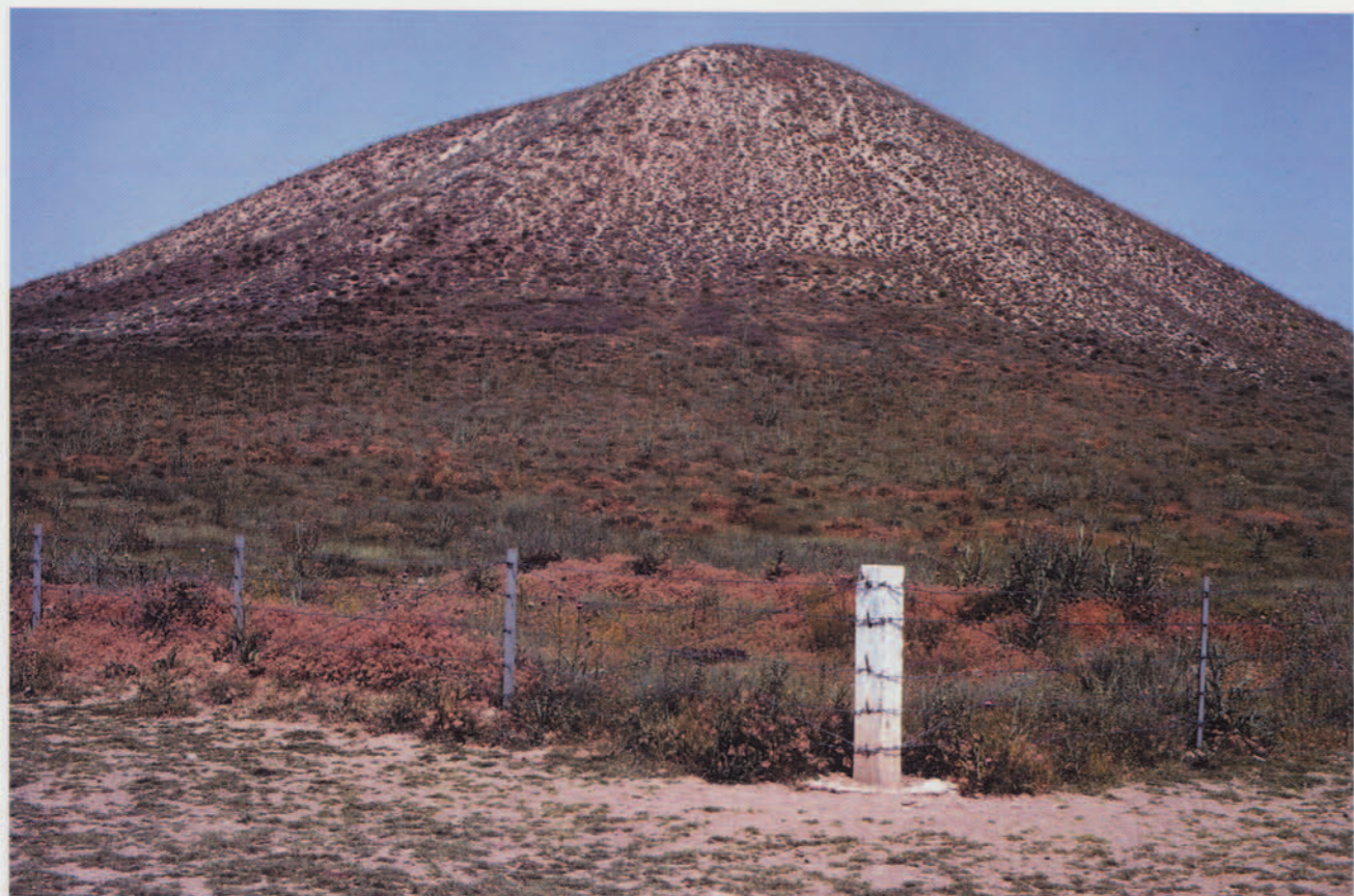
Fig. 4. Protected by the fence, it has not taken long for plants to spread onto the base of the mound. Outside the fence, the flocks still pass by and plant cover is sparse.

and showed us how the mudbricks should be set.