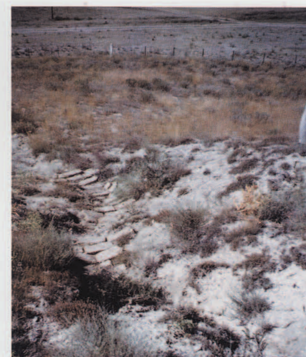
Fig. 6 (top right). Looking downhill after some of the mudbrick was laid in 1997.