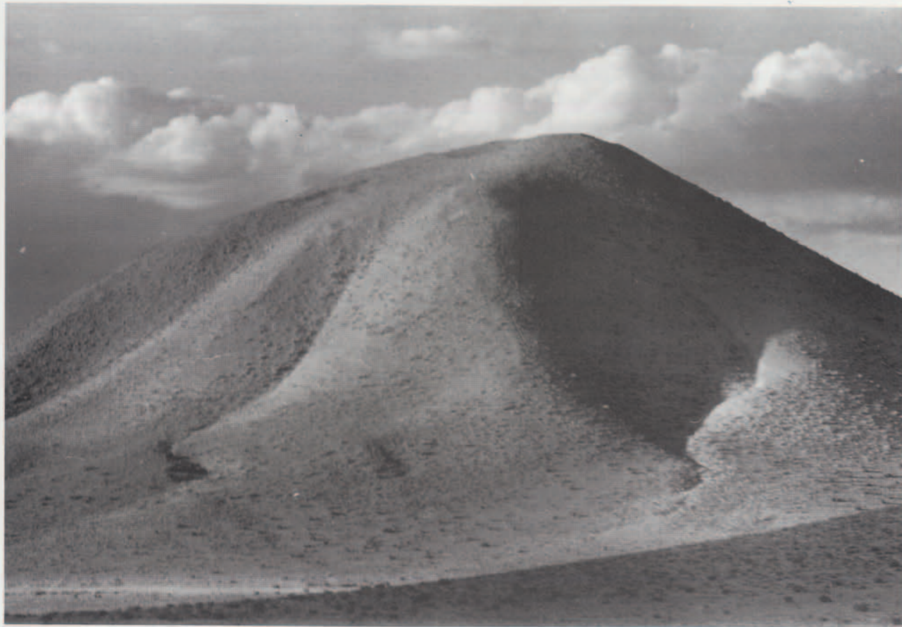
Fig. 1. It is dramatically clear from this photograph, taken in 1957, that the surface of the Midas Mound has been eroding for some time.