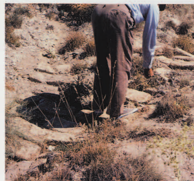
Fig. 5 (top left). Remzi Yilmaz sprinkling seeds between the bricks in one of the erosion channels. The bricks are laid across the channel in rows about 5 cm apart. Although several types of seeds were planted, only annual grasses survived.

Clearly, however, encouraging native plants works. As it stands, the variety of plants on the Midas Mound can survive the fluctuations