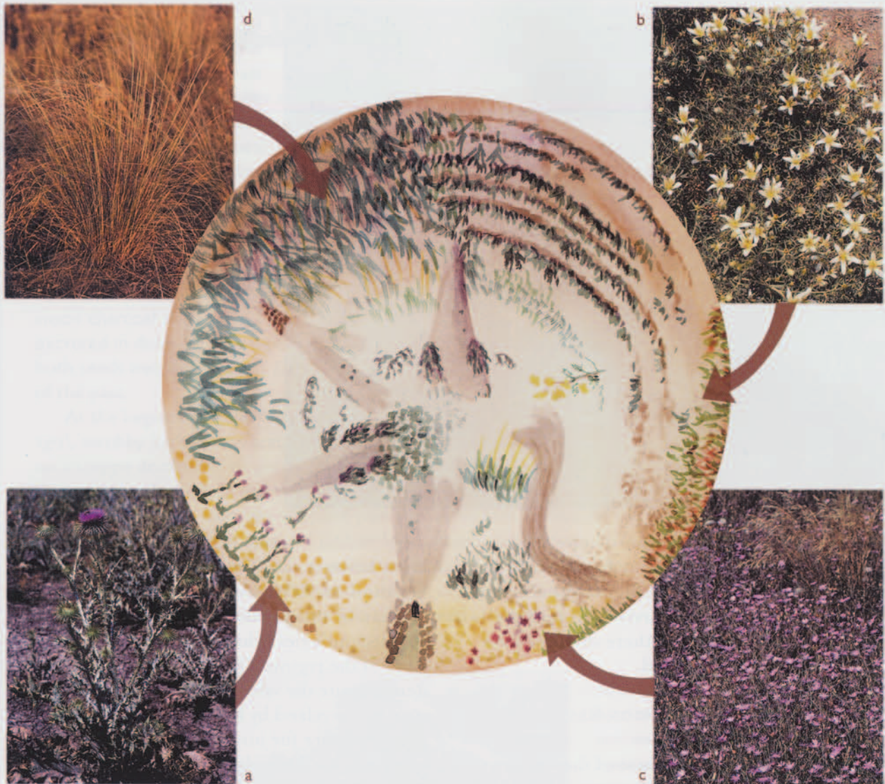
Fig. 9. Schematic watercolor of prominent vegetation on the mound as if seen from the air as we began the experiment with the bricks. Note that plant distribution varies according to slope and aspect. Thistles (probably Onopordum sp.; see 'a') thrive on the lower southwest slope and wild rue ( Peganum harmala ; 'b') continues to grow profusely on the southeast side of the mound along one of the main paths to the village from the surrounding pastureland. A small member of the daisy family ( Xeranthemum inapertum ; 'c') grows toward the base on the south side. Wormwood ( Artemisia sp.), so common but nondescript that I did not think to paint it, is relatively sparse only in the northeast sector. The painting also illustrates trails beaten through the wild thyme by sheep in years past on the northeast side, and perennial grasses thriving on the north side. One of these grasses, Stipa holosericea ('d'), is an important part of the native steppe vegetation of central Anatolia and makes a fine fodder.

As a Senior Research Scientist in MASCA (Archaeobotany section), NAOMI F. MILLER studies ancient environment and land use in the Near East. She has been working at Gordion, Turkey, on plant remains from the archaeological site. Her appreciation of ancient and modern vegetation in the region has also inspired the steppe restoration project for the Midas Tumulus, reported here. Other current projects include archaeobotanical investigations along the Euphrates river in Syria and Turkey and at Anau, Turkmenistan. You can visit her website at www.sas.upenn.edu/~nmiller .