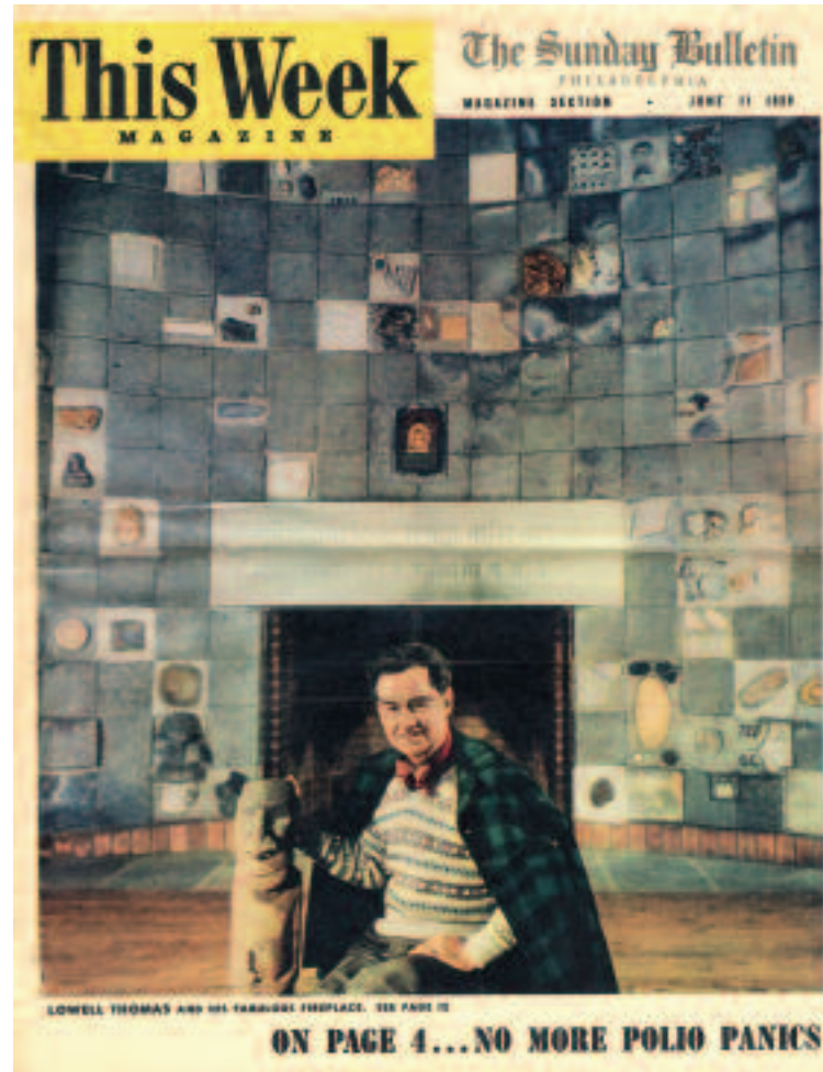
This Week Magazine of The Sunday Bulletin featured Lowell Thomas and his “History of Civilization” fireplace, June 11, 1950.

Thomas collected stones on his travels but also received many from people who heard him discuss his fireplace on the radio. He claimed to own pieces from the Dome of the Rock in Jerusalem, the Taj Mahal in India, the Egyptian pyramids, New