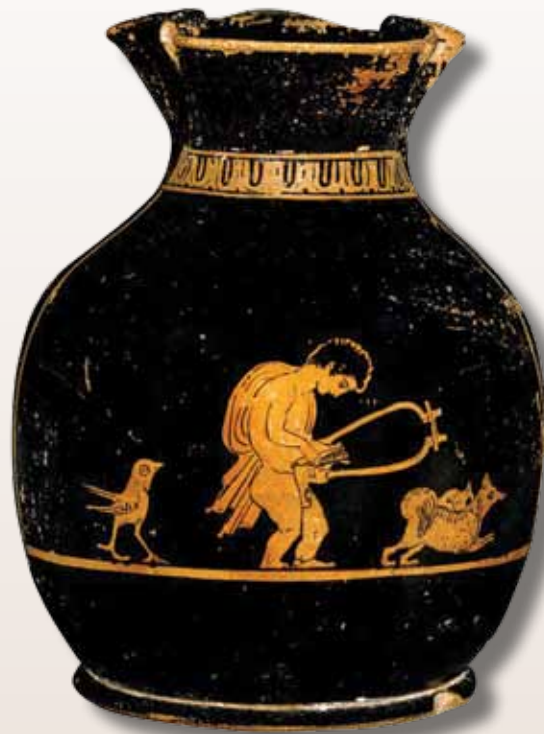
British Museum 1864,1007.231 (ca. 420–400 BC)