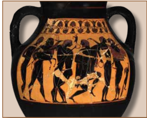
British Museum 1865,1118.39 (attributed to Berlin painter, ca. 540 BC)