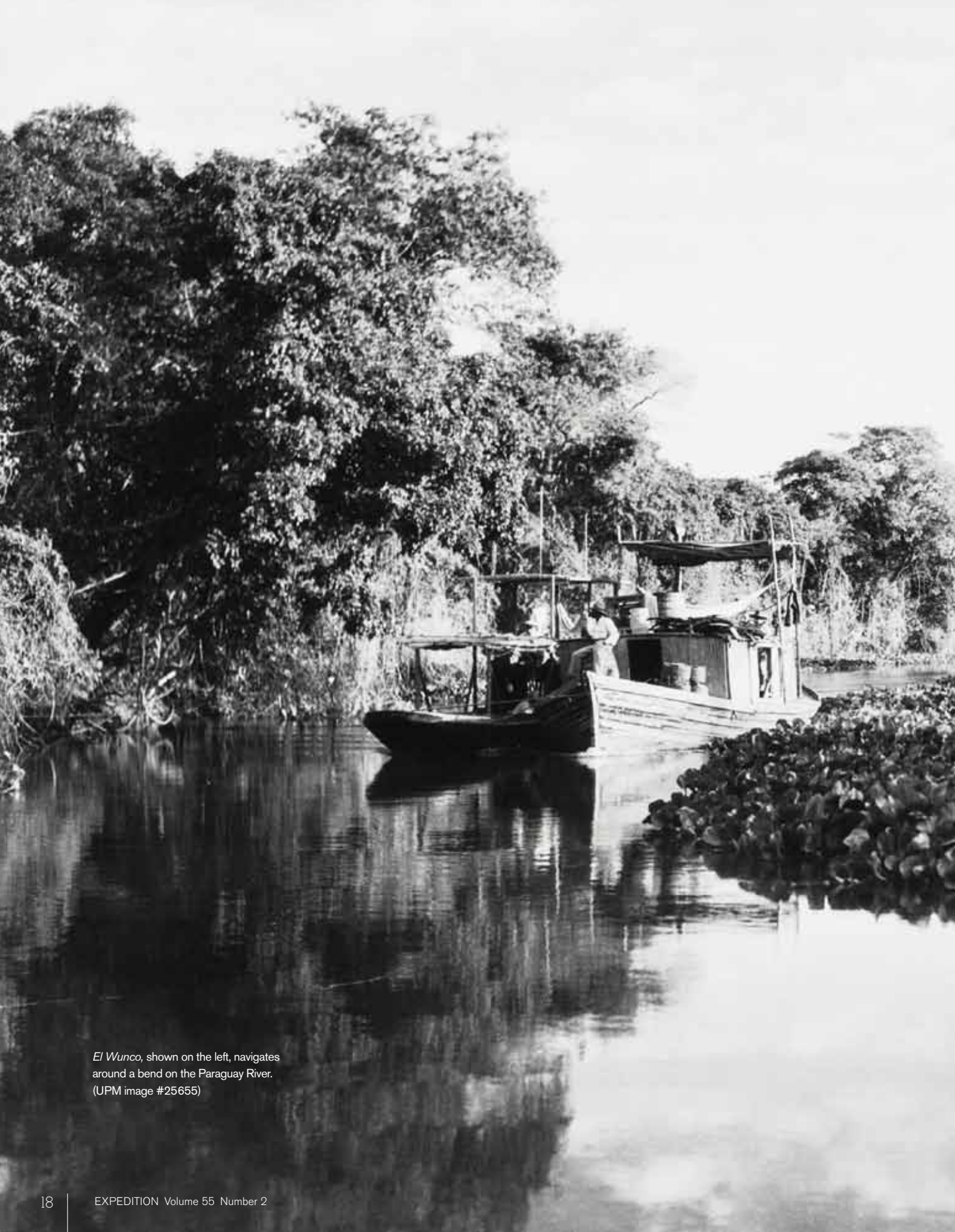
El Wunco , shown on the left, navigates around a bend on the Paraguay River.