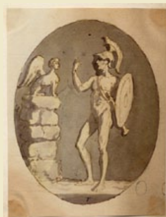
This drawing of an intaglio depicts Oedipus and the sphinx.

An iconic image of ancient Egypt, the sphinx is a hybrid creature. The archetypal Egyptian sphinx usually had the body of a lion and the head of a man—usually the king, although examples of female (queen) sphinxes exist. A combination of human and leonine elements endowed the sphinx with the intelligence of a human being and the awesome physical prowess of a lion. Sphinxes appear early in the Egyptian artistic canon and remain an important royal and divine symbol for the Pharaonic Period. The Egyptian sphinx was quite distinct from the sphinx found in Greek mythology. The Egyptian sphinx was a protective, positive entity, while the Greek sphinx was a fearsome and dangerous creature.