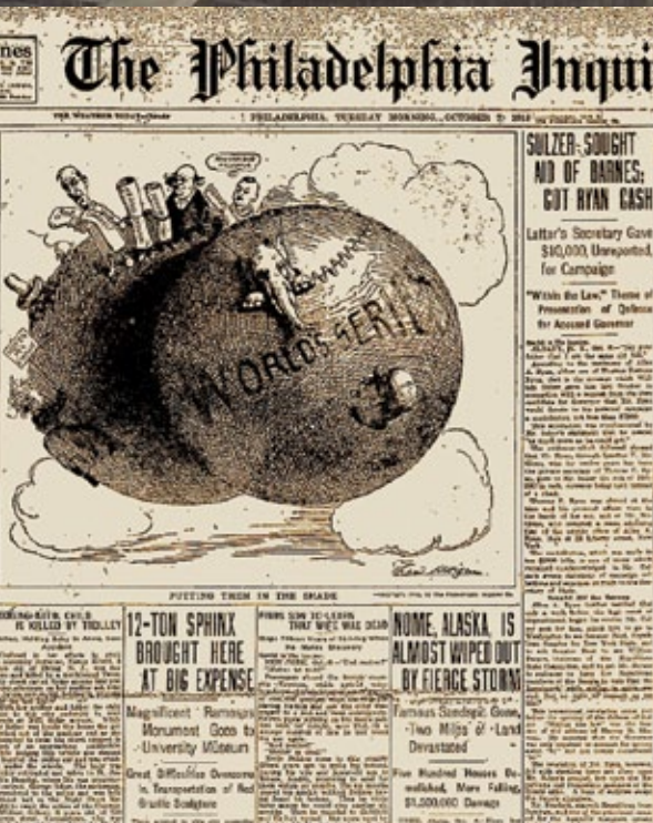
The Museum courtyard, ca. 1915. INSET, The sphinx shares the front page of The Philadelphia Inquirer with the opening game of the World Series, October 7, 1913.