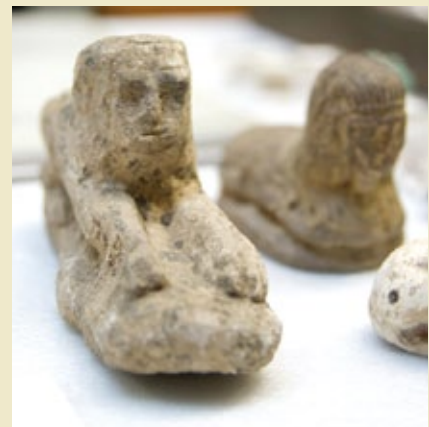
CLOCKWISE FROM TOP RIGHT, Terracotta sphinxes were made from molds in Memphis (UPM object #29-71-886). This humble limestone sphinx is from Memphis. The piece was clearly not carved by a master sculptor. (UPM object #29-75-422) This assortment of Penn Museum scarabs includes sphinx iconography. From top left (Museum object numbers): E11506; 86-35-219; E12859; E13042; E13812; 55-35-2; E11675; 48-10-13; E12832; E15281E; E13057; E13771; E12824; E11049; E13070; and E11047.