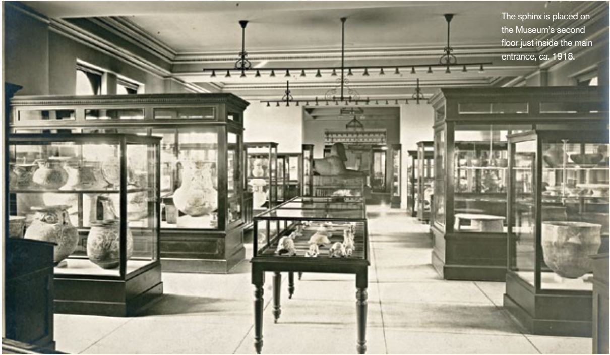
The sphinx is placed on the Museum's second floor just inside the main entrance, ca. 1918.

When I am three next month, it can't be me