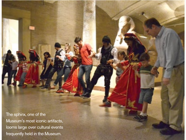
The sphinx, one of the Museum's most iconic artifacts, looms large over cultural events frequently held in the Museum.

Now, 100 years later, the Museum is considering moving the Merenptah Palace elements upstairs to what was originally intended to be their location—the third floor gallery, known as the Egypt (Mummies) Gallery. If