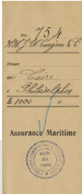
The sphinx was transported on the freighter D/S Schildturm (ca. 1915). Maritime Insurance was purchased for the sphinx for its voyage from Suez to Philadelphia.

to grab a front page spot in The Philadelphia Inquirer , below a wry cartoon showing the World Series, and overshadowing the more pressing issues of the day such as women's suffrage.