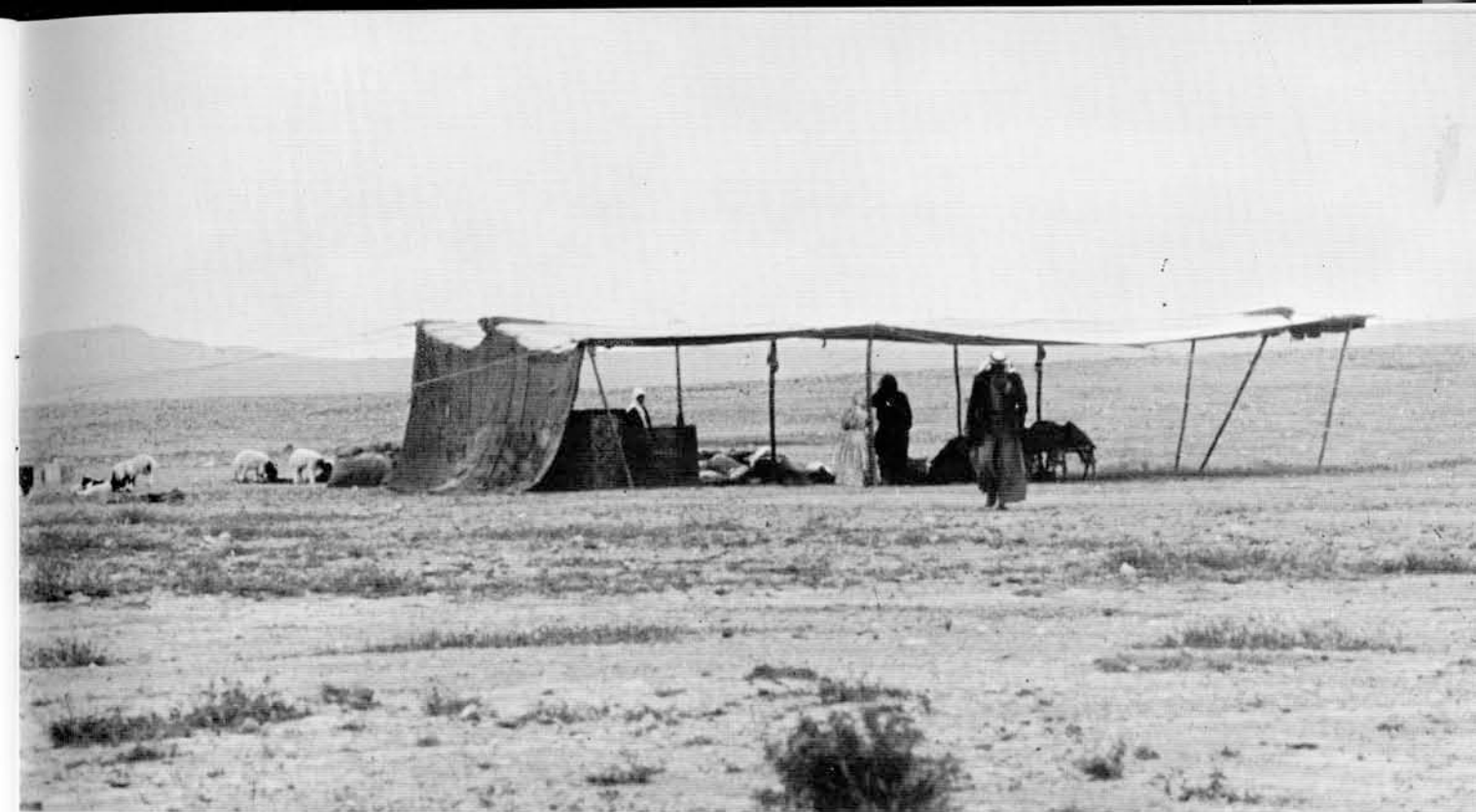
Tent of some Bedouin camped along the road from Resafe to el-Kom. This is an example of the simplest type of tent with only roof supports, a roof, and a sunshade at one end to protect the small enclosures containing food from sun and wind. Lambs graze on the sparse vegetation near the tent.

During the spring of 1967 in Syria we passed several tents of all types and sizes during a trip from Selenkehiye, a site fifty miles east of Aleppo on the west bank of the Euphrates, to el-Kom, about half way between Selenkehiye and Palmyra. Both sites were being excavated by the Euphrates Valley Expedition of the Oriental Institute of Chicago under the direction of Dr. Maurits van Loon. At el-Kom we had the unexpected pleasure of observing a band of Bedouin passing us on its migration north, and later enjoyed tea and the hospitality of some Bedouin who live permanently at Qasr el Heir, an eighth century A.D. site with two well preserved castles. The reason for our trip to Palmyra was to complete the recording of the test excavation the first team from the Expedition had made at the oasis site of el-Kom in order to discover what periods of time and civilization were represented there. The result was exciting, as the entire site dated to eight or nine thousand years ago and repre-