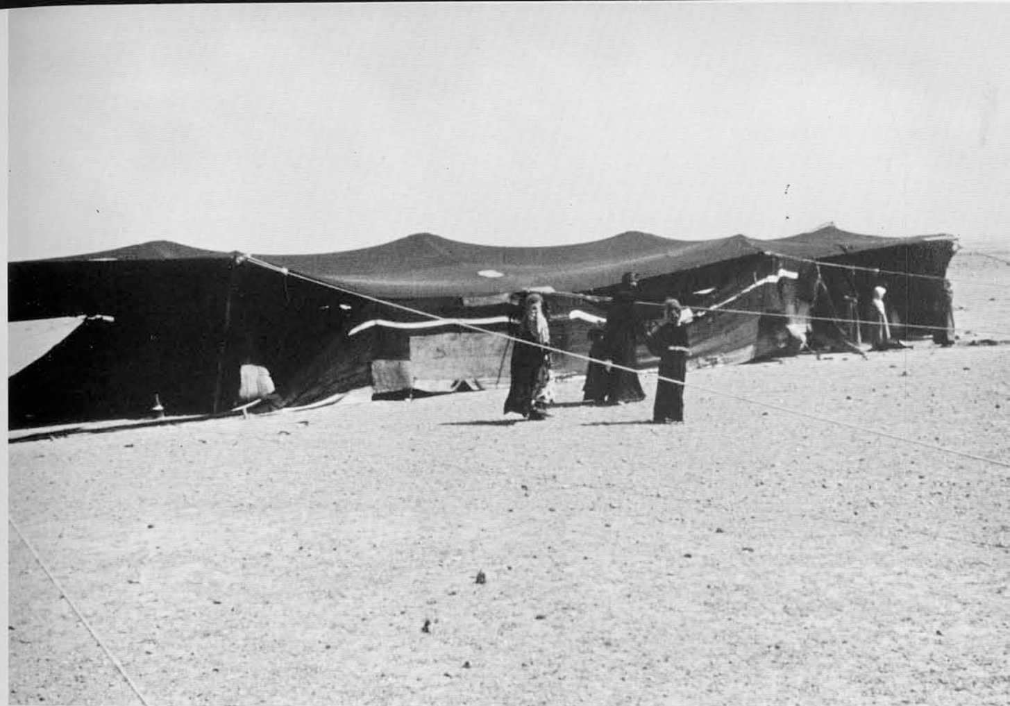
The exterior of the living quarters of the large tent at Qasr el Heir. The open area at the left of the picture shows part of the end used to receive visitors, where we were given tea. The wall curtain, which was let down on our arrival, is visible where it is attached to the roof pole at the corner. Five of the women living in the tent can be seen in the doorway at the far end of the living quarters and standing beside the tent.

It was at Qasr el Heir that we were given tea and allowed to look at and photograph our host's tent. It was large—about forty-five feet long and eighteen feet wide—with about eight poles down each side and a double row set in a V-shaped arrangement down the center to keep the roof taut. There were also long guy ropes from each side pole for the same purpose. The tent seemed to be inhabited by about ten people. When we arrived we were taken into the "public" end of the tent where pillows were brought for us and placed on the rugs which made the floor. The one wall curtain still up, of a natural tan color and more loosely woven than the black cloth of the roof, was let down so that the breeze could blow through (and because it was no longer needed to keep out the sun). The far end of this part of the tent was being used to store the wool from the shearing until it could be taken, probably to Soukhne, for sale. This wool was prob-