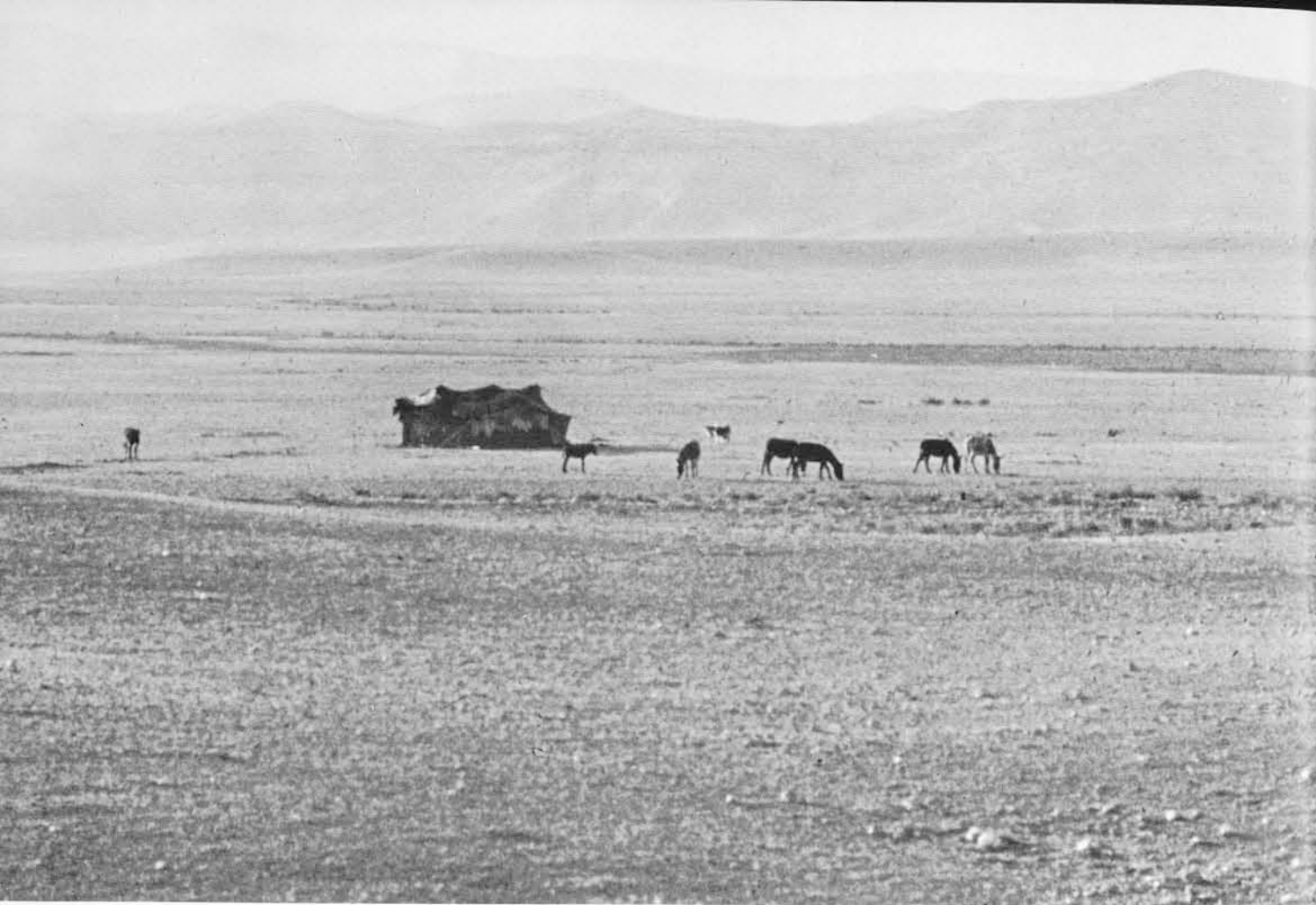
A completely enclosed tent at the mound of Hleyle, with horses and donkeys grazing on a small patch of grass in the dry terrain.

light loads of bedding. Other men and women walked, keeping the animals from straying and driving the flocks. Some of the camels too were occasionally ridden, as they had been since very early times in the region. Usually, we were told, they were ridden by women in the heat of the day in a covered howdah mounted on the camel's back.