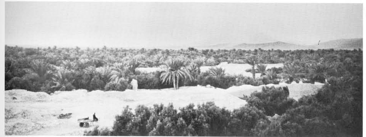
Overlooking part of the oasis of Palmyra with rain-storm which turned all the wadis into torrents and made the desert tracks treacherous as it approached us.

The other women and children remained behind the dividing curtain peering around it at us. Then the women of our party were allowed to go behind the curtain into the living quarters. We first passed through a short corridor formed by the exterior tent wall and by what appeared to be a