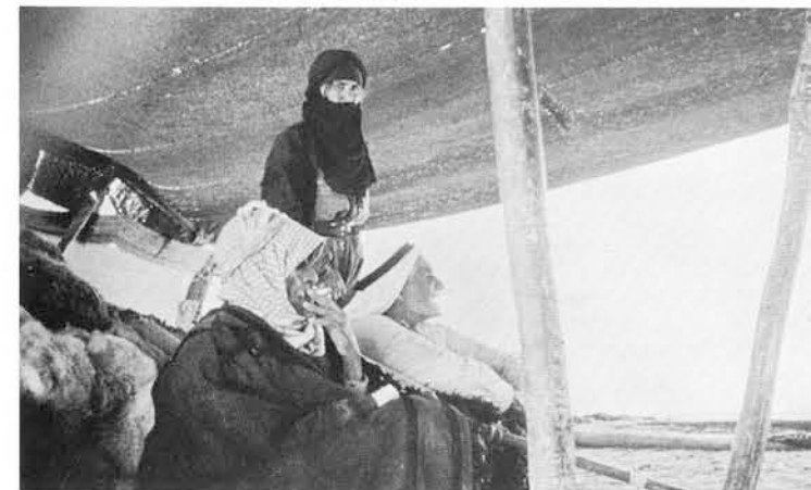
The interior of the visitors' part of the same tent, showing the far end where the large pile of wool is stored and at the moment being used as seats for two other visitors from another tent in the group. The wife of the owner of the tent stands behind them with her head and the lower part of her face covered with a black cloth. The two poles show the V-shaped arrangement used in the center of the tent to support the roof.

ably piled on a bed of stones as were grain sacks in other tents, but it overflowed the edges so this was not visible. These platforms are usually the chief evidence of a deserted Bedouin encampment, sometimes associated with the remains of a sheep enclosure. If the tent site has only recently been abandoned, holes where the tent poles were set may also be found and perhaps a shallow line marking where the sides had been, and maybe the remains of a small hearth. If the encampment site is an old one a sherd or two may also be found, but if recent there will be none as modern Bedouin generally use enamel or aluminum vessels. In fact, the first thing we were offered was water from an aluminum bowl. Water was even more precious at Qasr el Heir than usual as it all had to be brought in by truck for both the flocks of sheep and goats, which were only watered once a day, and for the people. The original water source for Qasr el Heir has not yet been found and there is some mystery as to where it may have been or from where and how the water may have been brought.