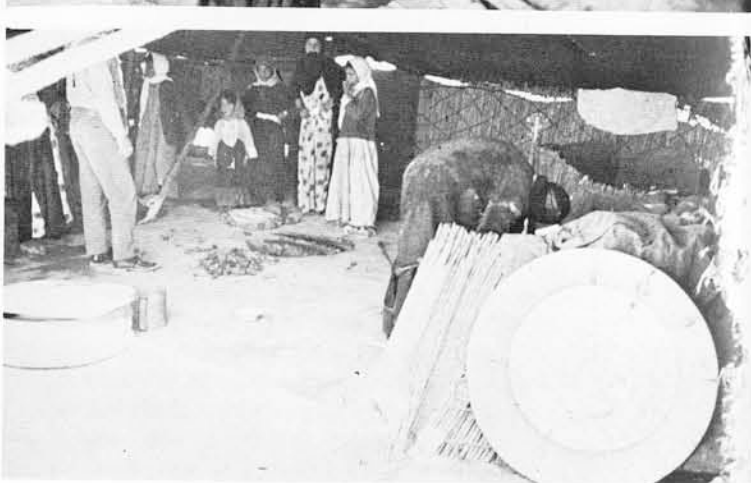
Views in the interior of the tent shown on page 37. (Upper left) Having tea with the curtain screening the domestic part of the tent from view behind. The curtain is woven in designs of black and red with narrow stripes of light tan near the top and bottom. A corner of the wall curtain made of strips of brown, light tan, and black shows in the left background. Again the V-shaped arrangement of the central roof supports placed along the horizontal bands strengthening the roof is evident. (Upper right) The sleeping area for the owner of the tent and his wife is just behind the dividing curtain. The owner's wife stands in the entrance to the area flanked by our government representative and several children. The area is enclosed by a low reed fence. In the foreground are the mattress and pillow put out for us when we entered. Lambs lie in the corridor to the left of the sleeping enclosure. (Center left) The center of the domestic area with its neatly swept floor. The hearth with the two iron bars across it is in the middle of the area with fuel in front. Behind it are the round convex disc on which bread is baked, and also a basket containing sacks of what is probably either grain or flour. Hidden behind the women are the food enclosures. (Center right) The far end of the domestic part showing the low reed-enclosed areas for food and water. In front of this is a low reed-covered shelf with an enamel bowl and other domestic implements. (Lower right) A view through the doorway of the domestic part of the tent with a large metal tray propped against a food enclosure. The hearth is in the center and to the left is the sleeping enclosure with the dividing curtain just beyond.

As soon as it was ready, tea was brought and drunk as we were entertained by the owner of the tent, a man of probably about fifty-five with a white beard, and his wife, who stood apart, the lower part of her face covered with a black cloth, as were those of other women in the tent.