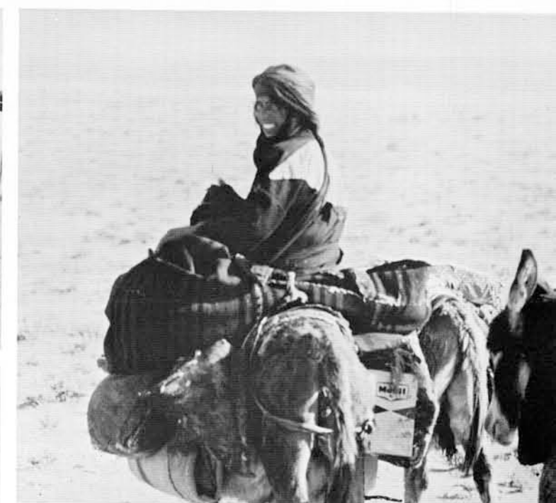
(Top) Bedouin passing by el-Kom on their migration north to near Resafe. Donkeys carrying colorful loads of bedding are being ridden by men and women. (Center left) A rather elaborate tent on the road from Resafe, with an enclosure for the living quarters made from a shoulder-high fence of reeds bound together with rope made from twisted goat hair; sheep are kept near the tent. (Center right) A girl riding a donkey carrying bedding and saddlebags made of tightly woven red and blue material. (Bottom) A woman who, with her husband, has just finished tying a tired or sick sheep onto a donkey loaded with saddlebags woven of black, tan, and brown wool. The sheep is tied on with a rope of twisted goat hair while the load below is bound with bands woven in red, black, and tan designs.