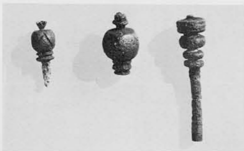
Several bronze pinheads and earring pendants were found in the deposit.