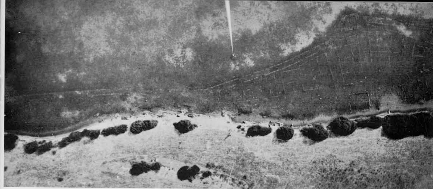
The city wall, a gate, and houses in shallow water, photographed from a balloon.

The most interesting contribution of the archaeological evidence from the historical point of view is the fact that the city was not founded for the first time by the Tirynthian exiles, as we had been led to expect. Others before them had obviously recognized the strategic value of the location with its hidden harbor and its view of