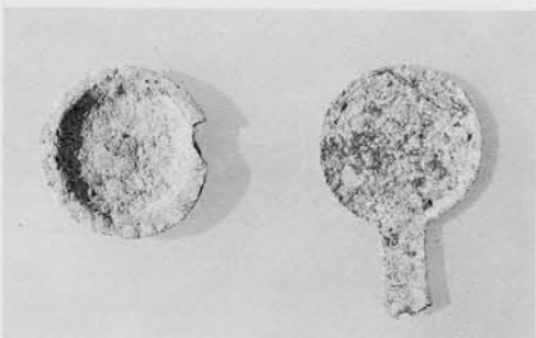
Small bronze shield and mirror. The end of the mirror handle is broken off at the point where it was perforated for suspension.

the entrance to the Argolic Gulf. It is also noteworthy that, although the historical record indicates several sharp changes in the control of the city in the Classical period, there is little indication of these shifts in the archaeological evidence. In fact, the picture is rather one of a considerable degree of continuity.