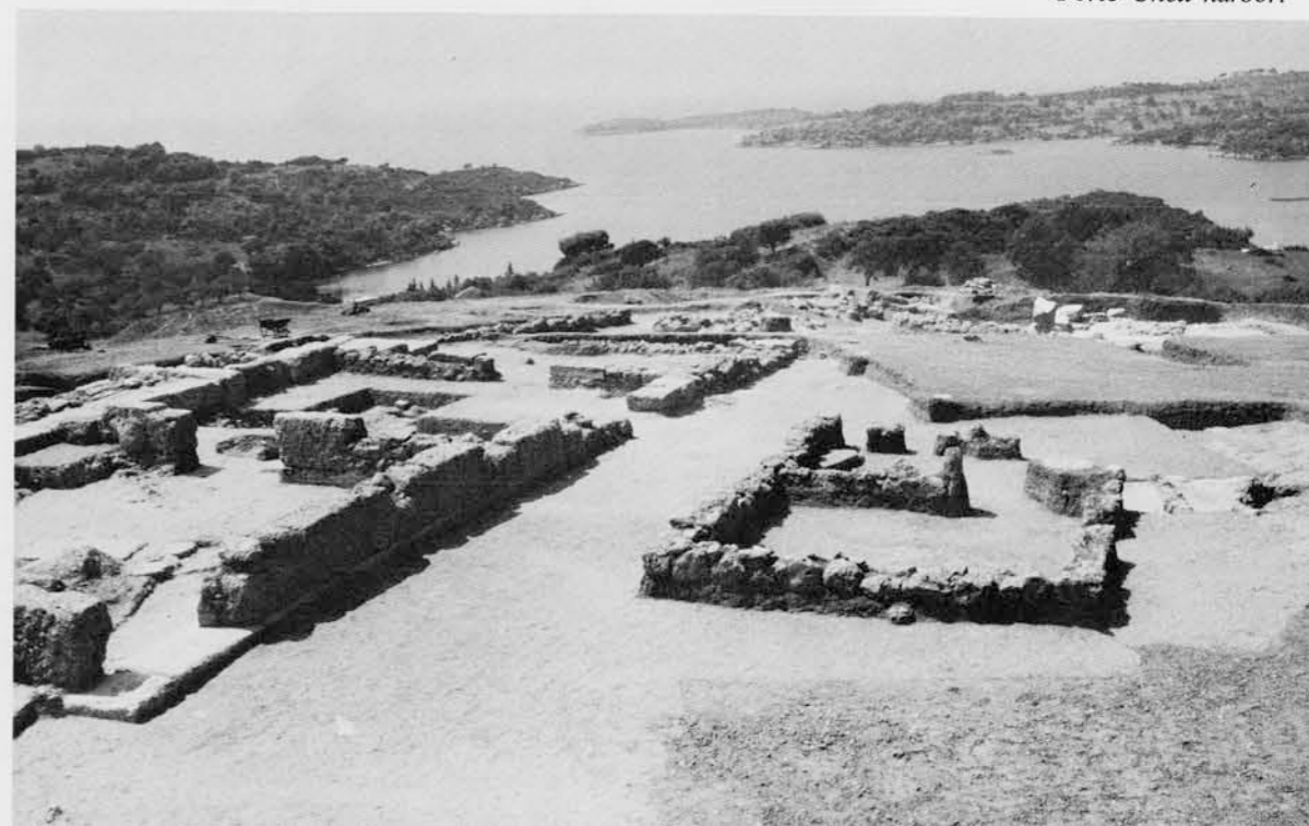
View of acropolis looking west from sanctuary area. On left, square tower and bar- racks; in center, small building constructed after abandonment of the city; in distance, chan- nel from Argolic Gulf into Porto Cheli harbor.