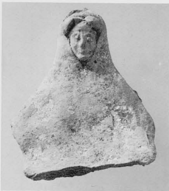
Terracotta figurine with handmade body and mouldmade head, wrapped in a large cloak.