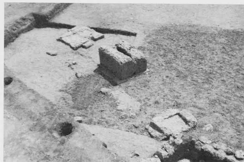
Sanctuary from NW. The statue base is in the foreground, the altar in the center, and the third base behind.