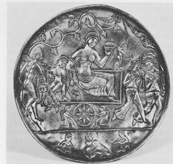
Fourth century Sassanian shallow silver bowl on low ring foot. Bacchanalian triumphal scene against a gilded background; panther drinking from a vase, flanked by musicians. Diameter, 22 cm. Freer Gallery of Art Collection.

One of the problems with the analysis of silver is, of course, that it is a precious metal, and therefore possibly the object of constant recycling.