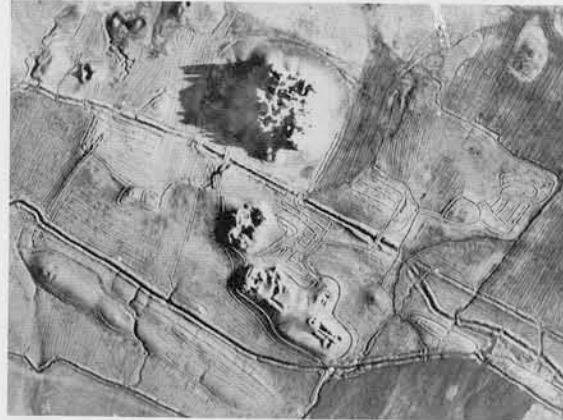
Aerial view of Chal Tarkhan mounds near Rayy.

sistent. The Partho-Sassanian pottery from the province of Fars cannot be used as a safe guide for the identification of sites in Kurdistan, although both regions lie within the Zagros mountain chain. The only survey within a given region that can be considered really reliable is one that follows the excavation of a site within that general area. In this way the basic ceramic types are known and important factors encountered in a survey are not overlooked simply because of lack of recognition.