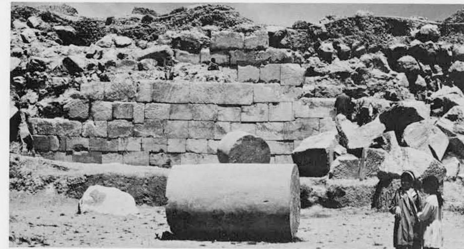
The Parthian Temple of Anahita at Kangavar, currently being excavated by the Archaeological Service of Iran.

presents difficulties that do not occur in the case of the superimposed strata of a protohistoric mound with which archaeologists are more familiar. On a site covering three square kilometers, the problem of what to look for and where to dig becomes much more acute. Ironically, the very thing that saved the city from obliteration—the lack of a mediaeval overburden—is what causes the ruins to waste away. Without later levels to cap the ruins, walls erode with nothing preserved but the foundations. It seems to be a curious phenomenon of Partho-Sassanian mud-brick architecture that foundations were often built in the form of casemented walls packed with fill. The foundations are like a platform whose supporting walls do not bear any direct relationship to those that were above. With unchecked erosion the plan of the building disappears; the objects contained within the platform foundation fill are as unrelated to the structure as they would be in a pit. The most celebrated example of a Sassanian New Town, Jundi Shapur, seems to have suffered from precisely this phenomenon. According to information derived from test trenches sunk by the Oriental Institute in 1963, such mounds as do exist on the site appear to be nothing more than huge piles of fill that perhaps belonged once to some form of casemented platform, as a substructure for buildings long since disappeared.