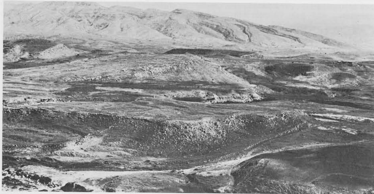
Elevated platform at Tell-i Badr in Elymais.

should examine one of the fire temples in Fars, together with the adjacent village to try to see what part the temple played in the lives of the people. For instance, there is the plain of Farrashband where Mihr Narses, Bahram's prime minister of orthodox Zoroastrian faith, founded four fire