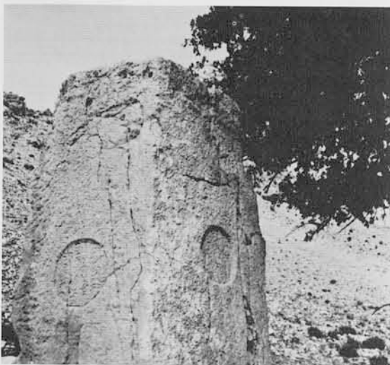
Fire altar at Tang-i Karam near Sarvistan.

in the lee of a Zoroastrian fire temple, the material symbol of the Sassanian state church. As yet we cannot be too certain what the relationship between the state church and the local community really was. The excavations of the German Archaeological Institute at Takht-i Sulaiman give us revealing insights into the makeup of one of the great national shrines. Work done by Roman Ghirshman in Elymais offers us tantalizing glimpses of local cults possibly snuffed out by orthodox Zoroastrian zeal. To complement the picture we