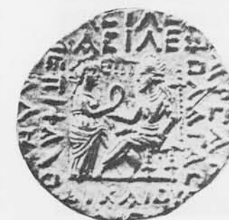
Tetrachms of Pacorus II and Vologases II with names and dates in Greek.

sions in order to establish their right to rule as heirs of the Achaemenians. One such title was "king of kings." In some of the titles there may be nuances of meaning that were not present in the original. The history of the period involved is intricate even though many of the facts are obscure. To pass any sound judgment on the nature of Partho-Sassanian social organization it is essential to know the meaning of a title and the time when it was used.