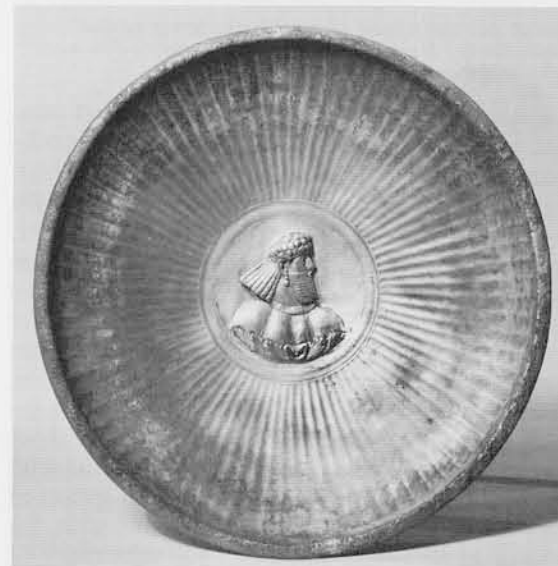
Silver bowl of the 3rd century A.D. Outside plain and without foot; inside, fluted side walls up to gilded center medallion with bearded male bust rising out of a leafy calyx. Diameter, 21 cm. Freer Gallery of Art Collection.

It can now be claimed that the techniques of the manufacture of Sassanian silver vessels can be determined by various electronic microscopic probes and X-ray photography. Such tests are with increasing precision able to tell us, for instance, whether a vessel was cast or hammered; whether alloyed or gilded; and whether the design was added by a repoussé or chasing technique. It is also possible to analyze the metal and determine the actual silver content of the so-called silver vessel. Though a chemical analysis of a plug drilled from the vessel is preferable on account of the greater size of the sample, reducing the possibility of misleading result, a non-destructive method of analysis—termed neutron activation analysis—has been devised, whereby a