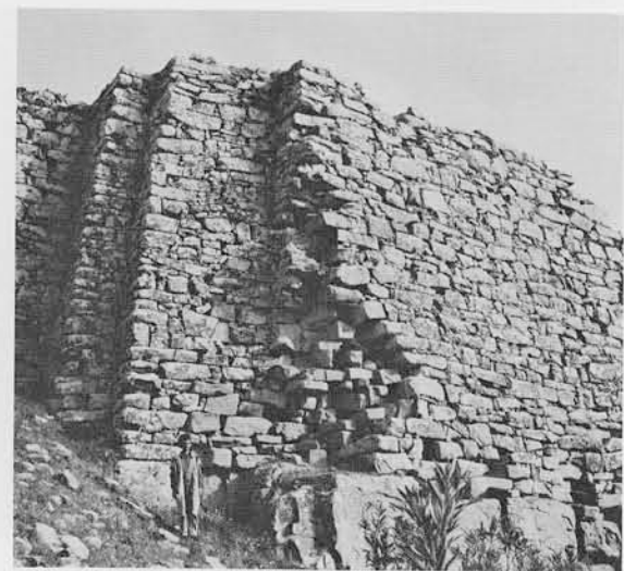
Stone wall which is located on the far side of the flat area seen in the center of the upper photograph.

in the lee of a Zoroastrian fire temple, the material symbol of the Sassanian state church. As yet we cannot be too certain what the relationship between the state church and the local community really was. The excavations of the German Archaeological Institute at Takht-i Sulaiman give us revealing insights into the makeup of one of the great national shrines. Work done by Roman Ghirshman in Elymais offers us tantalizing glimpses of local cults possibly snuffed out by orthodox Zoroastrian zeal. To complement the picture we