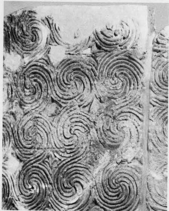
Carved Sassanian plasterwork from Chal Tarkhan. University Museum Collection.

The immediate obstacle facing the would-be excavator of an imperial Partho-Sassanian city is the fact that many of them have been built upon up to the present day and have been subjected to constant rummaging for building materials and to denudation by ploughing. In these cases our information is usually limited to the knowledge that there exists a piece of city wall or a ruined fort, for which it is often difficult to determine when it was built and for what purpose. Rayy is an obvious example. Excavations were conducted there by Erich Schmidt between 1934 and 1936. Digging by commercial operators and the vast extent of the site reduced the chances of making many interesting discoveries using conventional archaeological techniques. The trash pit was often the source of interesting finds, but enormously destructive to the archaeological context. In fact, the pit may be the worst obstacle in the excavation of an early mediaeval city.