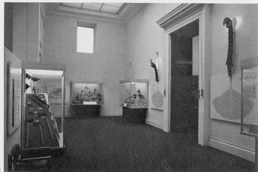
2 Migration period material display today.