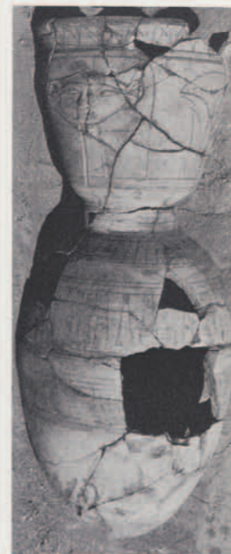
11 Decorated pottery from the palace-city