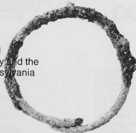
1 Steel bracelet (I.55) with overlapping terminal from burial cave A4, Baq'ah Valley, Jordan. One of twenty or more early iron ornaments found in this cave.

In December 1982, the Archaeological Institute of America holds its annual meeting, in Philadelphia. Of the various scholarly issues to be discussed, a technological theme will receive particular emphasis: the role of metallurgy in ancient cultures. For the past several years scholars from a variety of disciplines at the University of Pennsylvania have directed their research towards this topic. The contributions in this issue of Expedition were prepared by some of these scholars whose disciplinary specialties include Anthropology, Near Eastern, Classical and Historical Archaeology, Ancient History and Metallurgy. Depicted on the cover of this issue are images which reflect the blend of disciplines which characterize archaeometallurgical research: the analysis of technologically derived materials and the