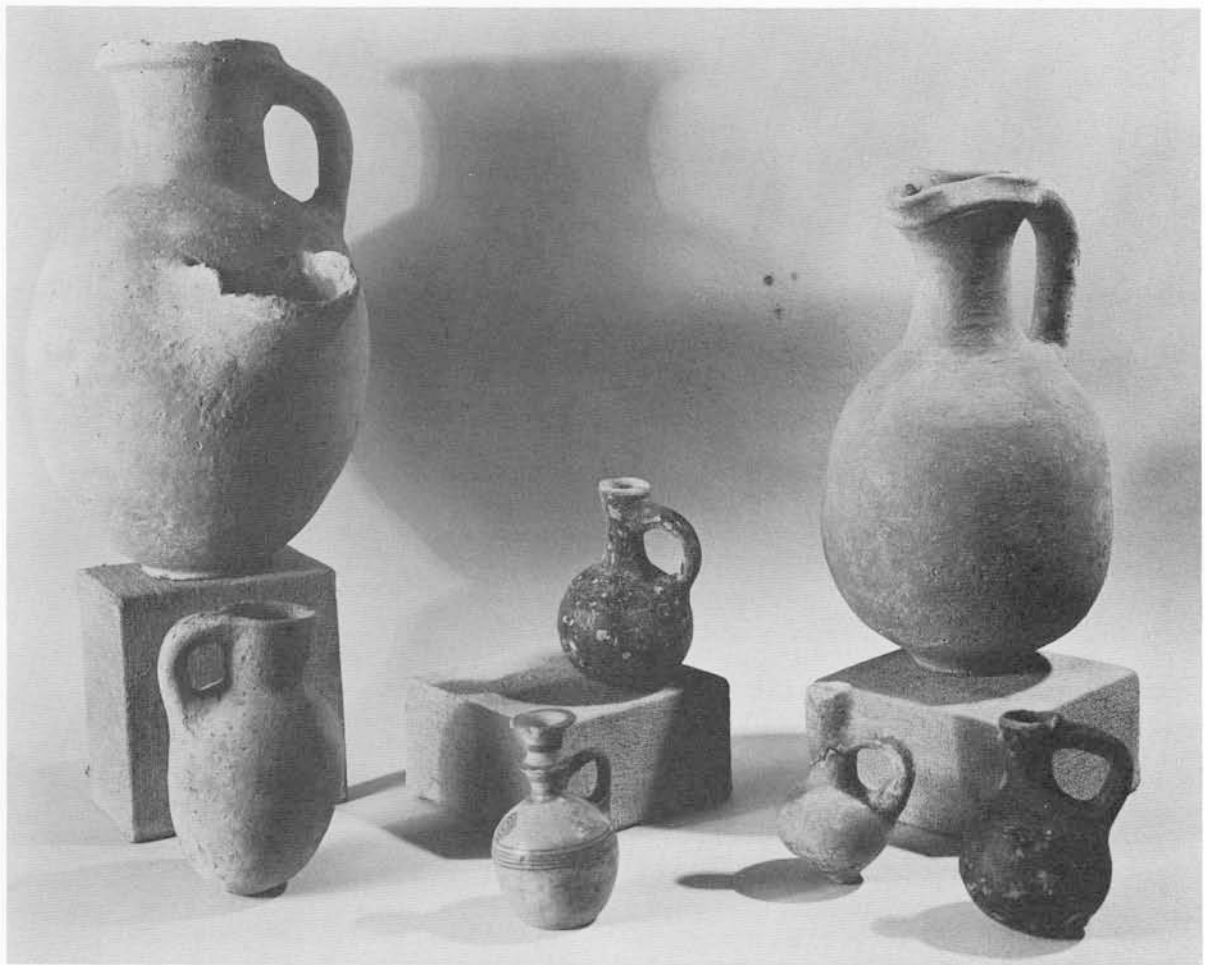
Well-known pottery of the types used by the Israelites at Beth Shan

buildings, the ruins of which are still visible. Thus, except as represented in the tombs and summit sanctuaries, Scythopolis lay beyond the scope of the Museum excavation. The tombs themselves, however, were very rich in burials of this period. They have produced an enormous quantity of Roman glass and some include a charmingly crude bust of the deceased, so ingenious as to be true folk art. Similar busts are known elsewhere near Beisan, but not in other parts of Palestine.