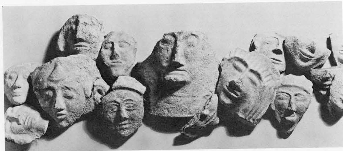
Besides thwarting archaeologists in the matter of written records, Palestine also fails to yield information as to what its people looked like, as it is almost completely lacking in sculpture and painting. The written records of Beth Shan, however, are matched with pictures of its residents: Canaanites painted on a pot; Philistines from the faces on their clay copies of Egyptian anthropoid sarcophagi; the people of the Graeco-Roman city from the endearingly crude portrait busts placed in their graves.