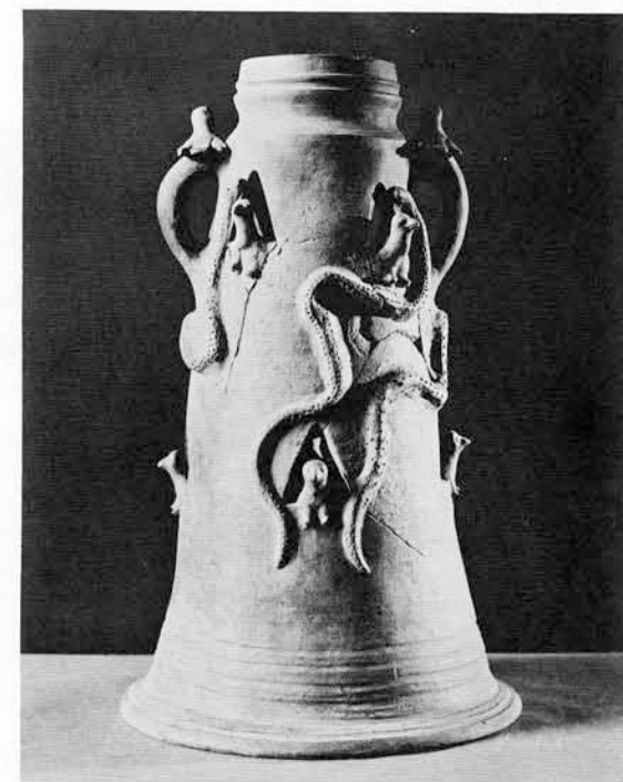
The Hebrew prophets condemned, but rarely elucidated, Canaanite religion. The excavations at Beth Shan proved the existence of an amazing serpent cult there at about 1000 B.C., the temple being packed with terracotta cult cylinders some of which had very realistic spotted snakes crawling over them. The one shown here, about eighteen inches high, is one of the smaller cult objects.

This lack of written sources for years made Palestinian chronology very difficult. A fairly precise method of ceramic analysis has now been developed by which dates can be satisfactorily determined, but epigraphic evidence naturally is heartily welcomed for the cross check it provides. Hence the heavy basalt stelae from Beisan are almost worth their weight in gold, as their presence makes it possible to date precisely so