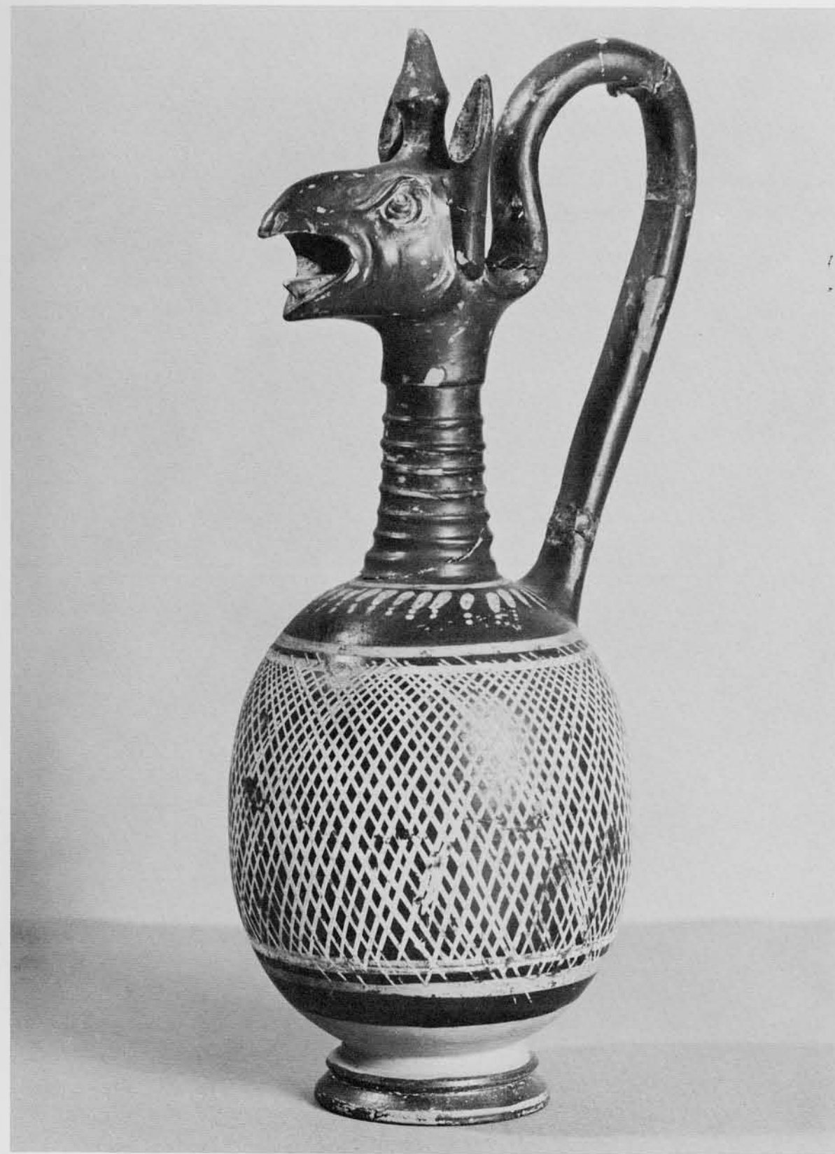
Vase of Gnathia Ware in the University Museum

Bronze was his proper medium, and many bronze busts (or protomes) of griffins once attached as ornaments at the shoulders of huge bronze cauldrons have come down to us. Such griffin cauldrons were worthy offerings for sanctuary or tomb, and many of the griffin attachments have been found at Delphi and Olympia where they were dedicated, as well as at Praeneste and Vetulonia in Etruria in tombs of the seventh century. The potters of this early period, like the later maker of our Gnathia jug, occasionally tried to imitate the form, but their brittle