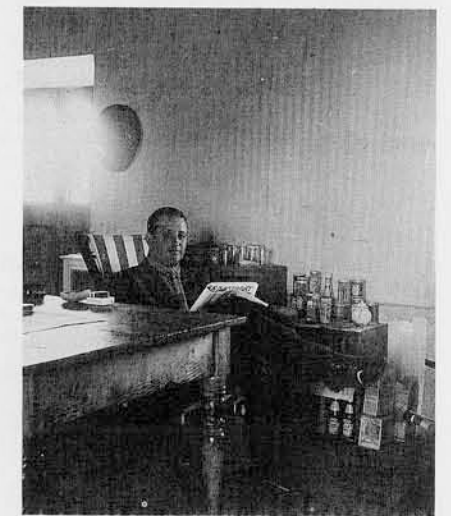
3 Kidder in the "Harvard Flat," Estacion de Pucara, Puno, during the 1939 project at Pucara.

In 1941 Kidder became involved with the ambitious Inter-American Affairs archaeological program.