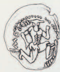
Coin, Knossos Graeco-Roman Period