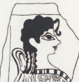
"Little Parisienne" wall painting, Knossos Late Minoan I Period