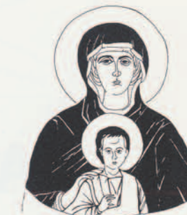
Byzantine icon Byzantine Period

Although Crete did not experience the tragic civil war that follows the devastation of World War II on the Greek mainland, economic recovery requires several decades. Within the last twenty years Crete experiences intense development for tourism and agriculture. While this means unprecedented prosperity for many of the island's population, a great price is paid in terms of continuing destruction of archaeological sites and antiquities. These remain both the heritage and legacy of Crete.