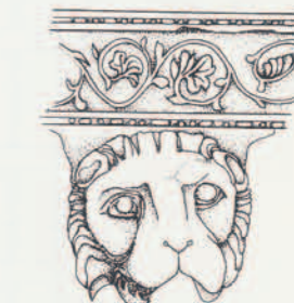
Venetian fountain ornament Venetian Period