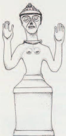
Late Minoan III-Early Iron Age female figurine with raised hands