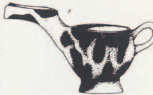
Vasiliki Ware "teapot" Early Minoan Period