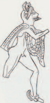
Incised metal plaque, Kato Syme sanctuary Greek Period