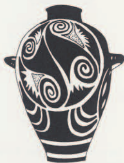
Kamares Ware jar Middle Minoan Period