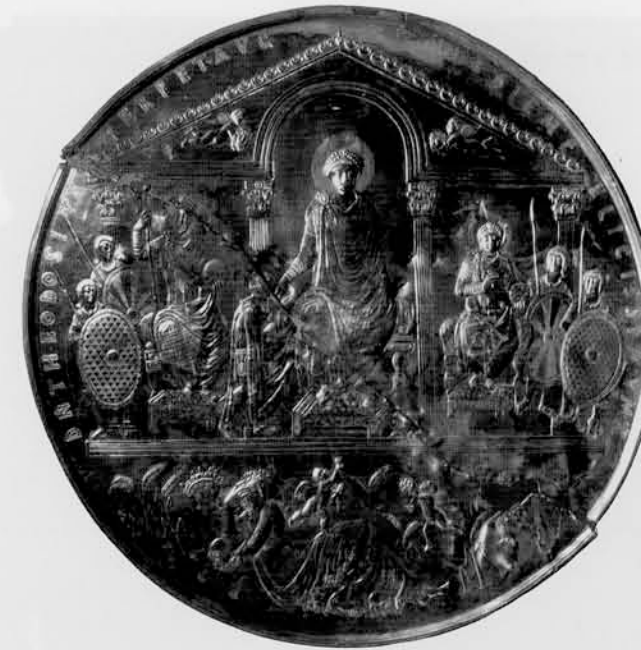
FIG. 1. THEODOSIUS MISSORIUM SILVER PLATE. The Theodosius missorium is a large silver plate, 29 inches in diameter (that at one point in its history was folded in half). At the center is the Emperor Theodosius I (379–395), conferring an honor on a civilian dignitary. His two co-rulers, Arcadius and Valentinian II, sit on either side. Next to them stand imperial bodyguards, marked out by their long hair and the torcs around their necks.

Besides these frequent public appearances, everywhere the emperor went part of the army and the entire imperial court would go, too (Figs. 1–3). For most of the late Roman period there were two emperors (though often more—in AD 308 there were six). Emperors handled military crises in person in the 4th century and so might be seen in the provinces with their entourage. Generals also could be accompanied by great ceremony, both at this period and later. On some of these occasions, the troops would be in what we can call "order of march," prepared for long-distance movement, with an emphasis on comfort rather than splendor. Not that we should see these marches as rambles through the countryside—they were hard work. A law of