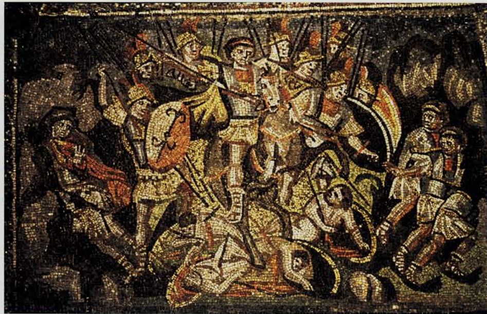
FIG. 7. JOSHUA AND THE AMORITES. Joshua is here portrayed as a Roman general, leading the Israelites against the Amorites. The artist has used contemporary 5th century styles to represent this Old Testament theme in this mosaic from Santa Maria Maggiore. Thus the Israelites are shown in the guise of Roman soldiers.

Christlich-archäologisches Seminar, Universität Bonn