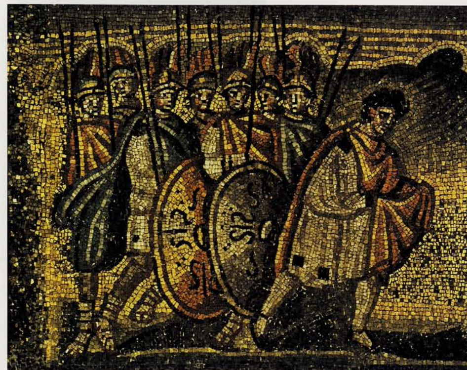
FIG. 5. JOSHUA BEFORE THE ANGEL OF THE LORD. This mosaic from the church of St. Maria Maggiore in Rome dates to the mid-5th century AD. The soldiers appear in parade dress, with cloaks and helmet crests similar to the troops on the Arch of Constantine, although Joshua is here represented as a civilian. The mosaic itself has been heavily restored and different artists worked on Joshua and the soldiers.