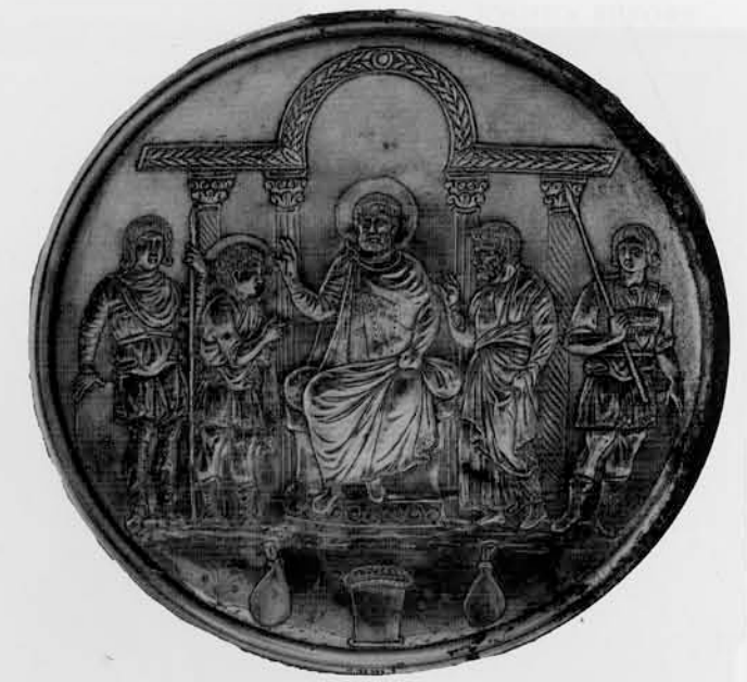
FIG. 2. DAVID BEFORE SAUL SILVER PLATE. In 1902 a set of nine silver plates illustrating the life of David was found in Cyprus. Because the imperial silversmiths used control stamps (similar to modern hallmarks), these plates can be dated to 613–630, i.e., during the reign of the Emperor Heraclius (610–641). Here the artist has depicted David talking to Saul in the iconography of an audience with the emperor. Saul's bodyguards, with their long hair (though no torcs), match exactly those from the Theodosius missorium, more than two centuries earlier.

The Metropolitan Museum of Art, Gift of J. Pierpont Morgan, 1917, acc. no. 17.190.397. Dia. 26.7 cm