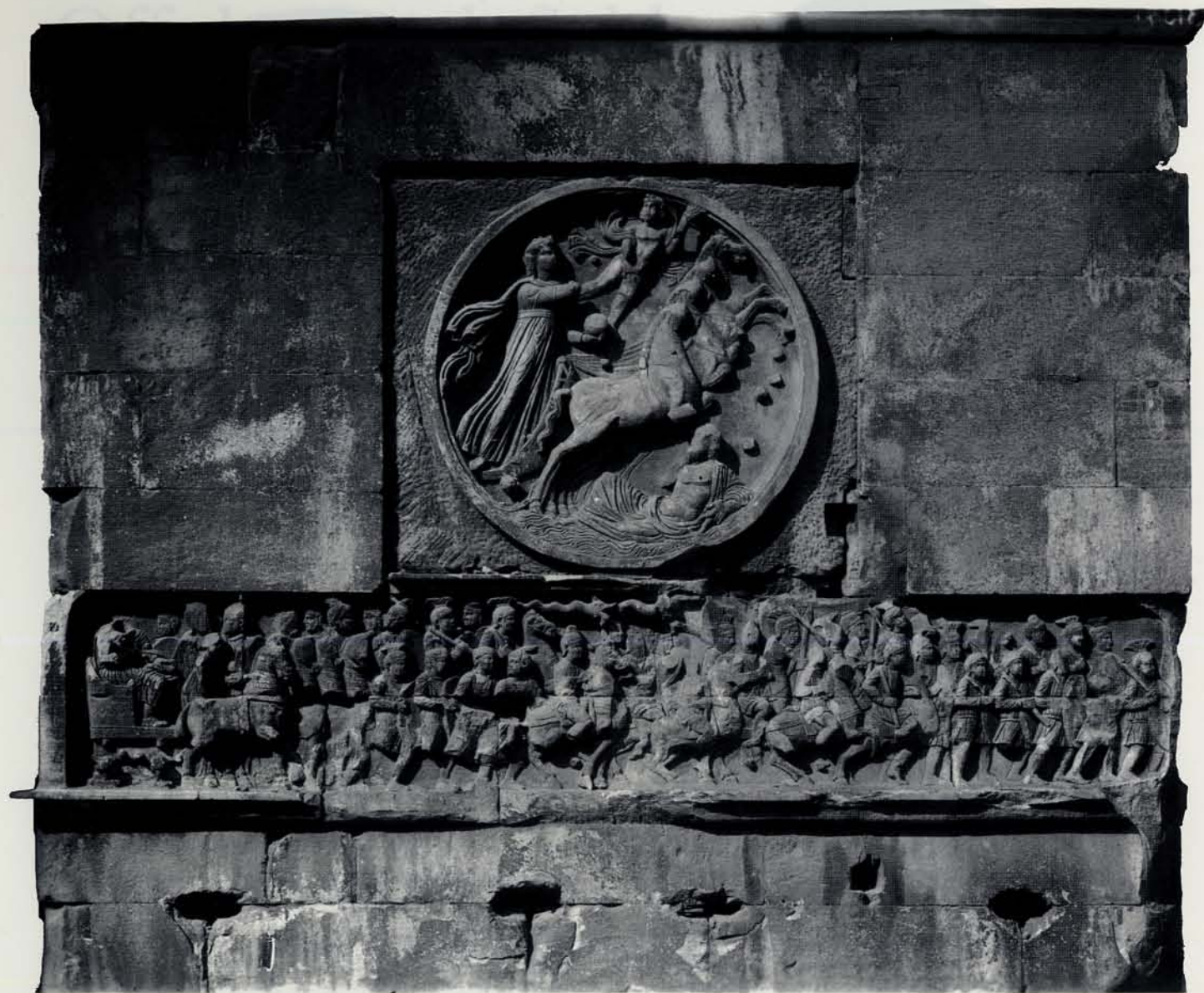
FIG. 4. ADVENTUS FROM ARCH OF CONSTANTINE. The Arch of Constantine I (306–337) in Rome, completed in AD 315, commemorated Constantine's victory over Maxentius. The contemporary relief shown here depicts his arrival ( adventus) at Rome in an elaborate chariot (bottom scene, far left). Constantine is surrounded by soldiers in full dress, with crests on their helmets. Note the dragon standards (at the center of the frieze) which had replaced the earlier eagles.