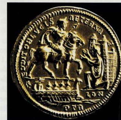
FIG. 6. GOLD MEDALLION OF CONSTANTIUS I . Constantius I (293–306) is shown on the reverse entering the city of London in AD 296. The legend reads REDDITOR LUCIS AETERNAE (The Restorer of Eternal Light). The city of London is personified as a female figure which kneels to receive Constantius before the gates of the city, while a Roman warship signifies Constantius' crossing of the English Channel. British Museum no. RIC34 (electrotype). Dia. ca. 4.1 cm

Constantine even extended military privileges to civilian members of the court because "those who follow our standards are not strangers to the dust and toil of the camp" ( Theodosian Code 6.36.1).