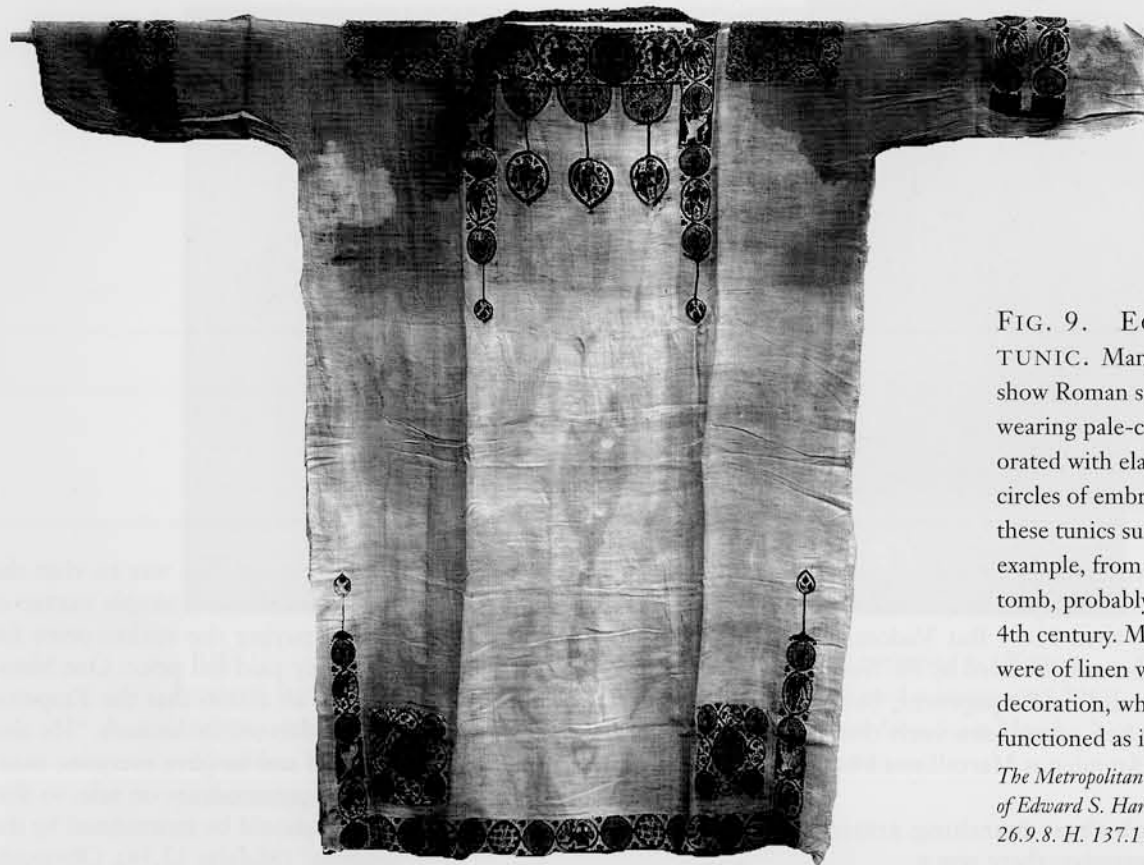
FIG. 9. EGYPTIAN TUNIC. Many illustrations show Roman soldiers or officials wearing pale-colored tunics decorated with elaborate bands and circles of embroidery. Some of these tunics survive intact. This example, from an Egyptian tomb, probably dates from the 4th century. Most of these tunics were of linen with red or purple decoration, which might have functioned as insignia of rank.

The Metropolitan Museum of Art, Gift of Edward S. Harkness, 1926, acc. no. 26.9.8. H. 137.1 cm