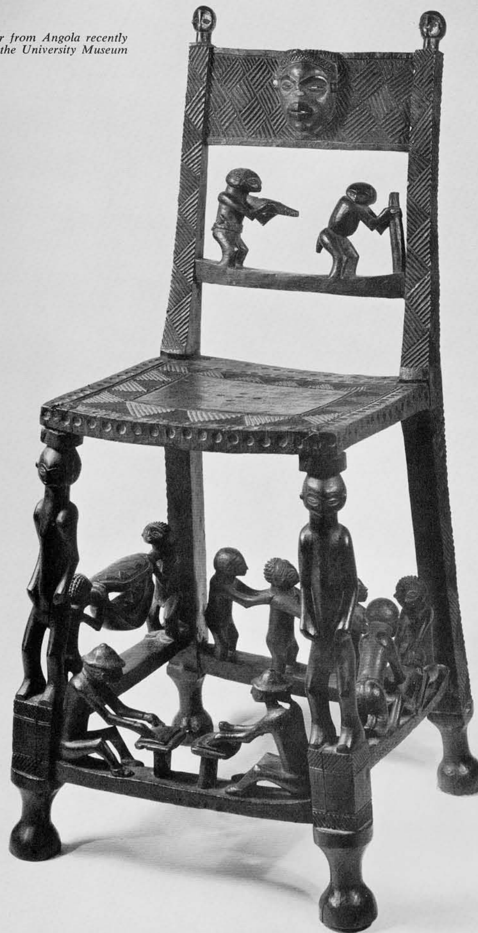
Chair from Angola recently presented to the University Museum

Native improvements on the basic Portuguese chair provide the charm and style of the museum