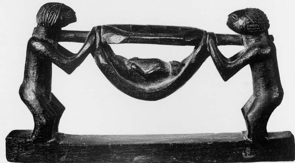
Details of the University Museum chair