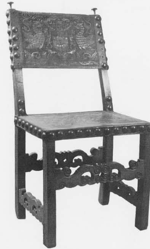
From a private collection in Portugal