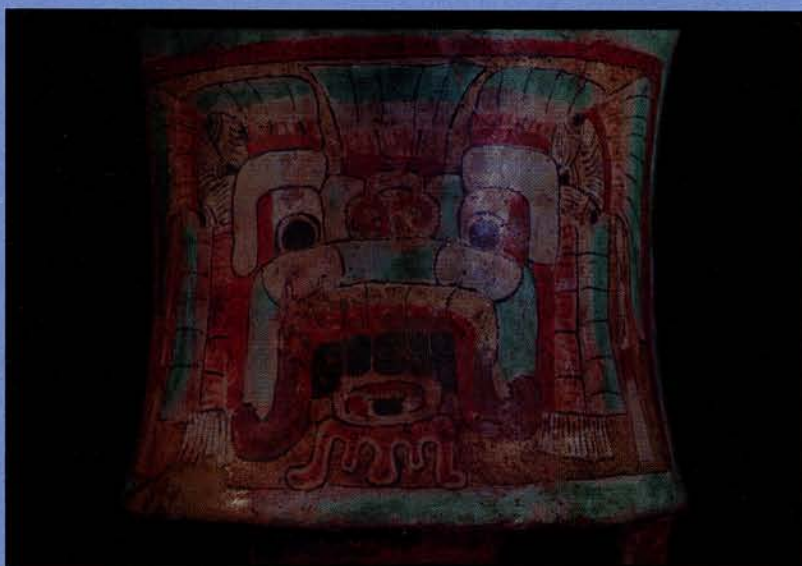
Fig. 8 (left). Close-up of the decoration on one of the vessels in Figure 7, showing the "monster" mask which is reminiscent of pottery motifs from Central Mexico.