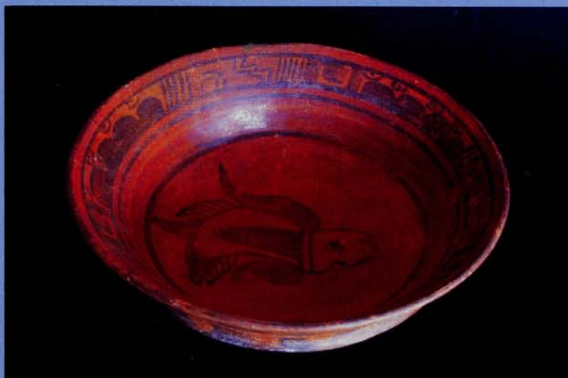
Fig. 9 (right). Red dish with fish motif from Sub-Jaguar Tomb. (1996)