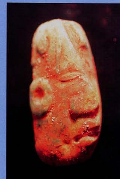
Fig. 4. Jade head covered with cinnabar that was part of the necklace worn by the royal woman buried in the Margarita Tomb. (1999)