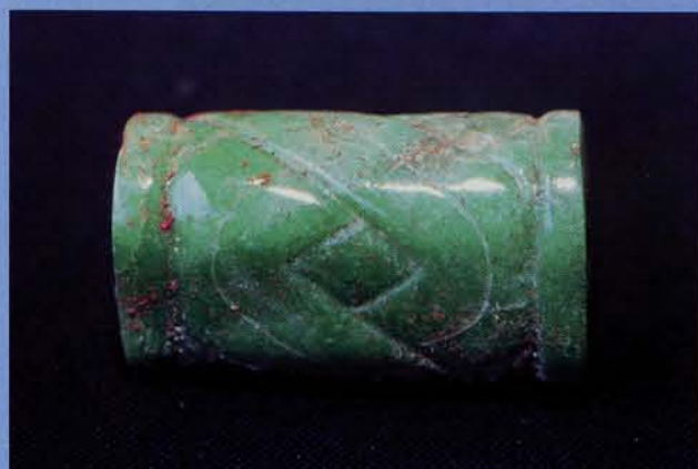
Fig. 1. Jade bead carved with the motif of a woven mat, a Maya symbol for rulership. The bead was found in the chest area of the man in Hunal Tomb who may be dynastic founder Yax K'uk' Mo'. (1999)