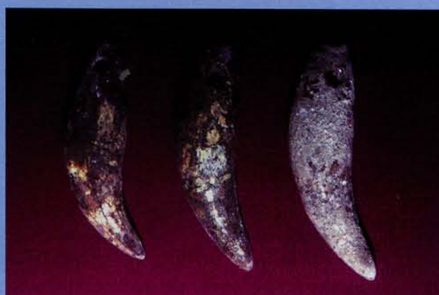
Fig. 2. Jaguar canines from an anklet found on the right leg of the man buried in Hunal Tomb. (1999)