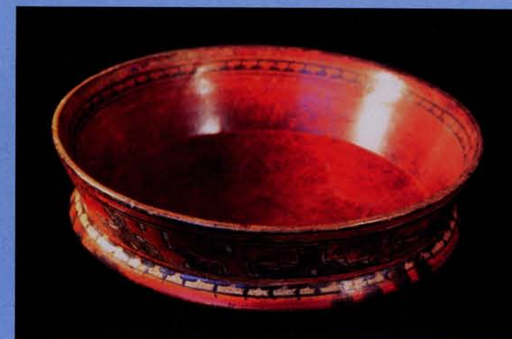
Fig. 6. Early Classic basal flange polychrome bowl from Margarita Tomb. (1996)