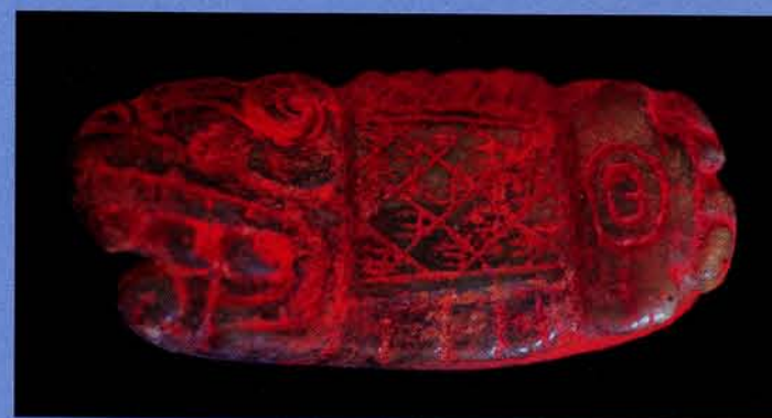
Fig. 5. Carved jade pendant from the necklace in Margarita Tomb (see Fig. 4). (1999)