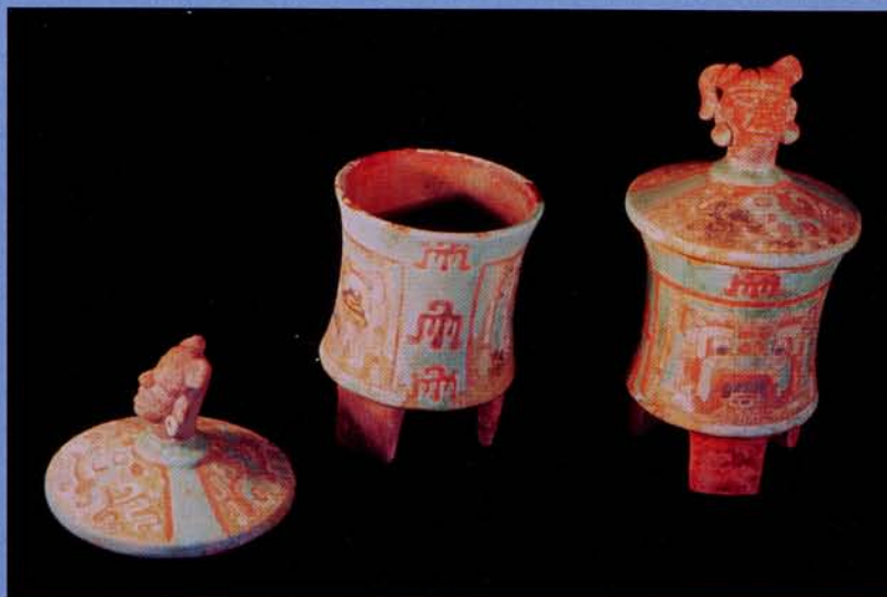
Fig. 7. Two lidded cylinder tripods with stuccoed and painted polychrome decoration. These vessels were found in Sub-Jaguar Tomb, which may be the burial place of Copán's seventh king. (1996)