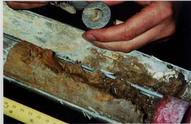
Fig. 5. The core from Lake Kumphawapi extracted by the Thailand Palaeoenvironment Project is here cut open and a sample of the sediment is being removed. The series of samples from the core, which was 6.18 meters in length, were sent to Australia for analysis by the author.

Around three hundred samples and an estimated 125,000 pollen grains later, a striking pattern of vegetation change began to emerge. Prior to the height of the last glacial period (20–40,000 years ago), northeast Thailand would have looked very different than it does today. My research indicated the presence of a forest dominated by Pine and Oak instead of the modern tropical deciduous forests. As the global