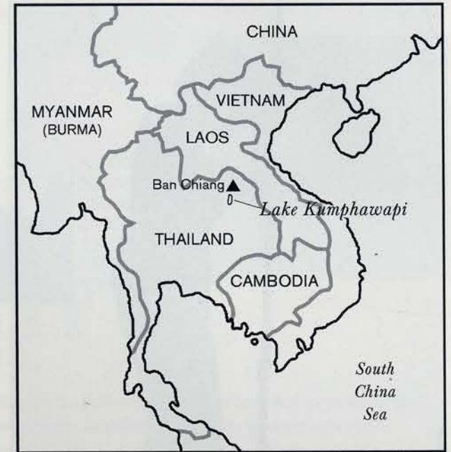
Fig. 3. Map of mainland Southeast Asia. Lake Kumphawapi is about 30 kilometers southwest of the archaeological site of Ban Chiang, Thailand.

Unlike archaeologists, palynologists are seldom rewarded with heart-stopping discoveries in the field. In stark contrast to the discovery of a human burial, for example, we are unlikely to uncover any evidence that can be seen with the naked eye. The fieldwork is also less glamorous. I worked in swamps and lakes in the Udon Thani and Sakon Nakhon provinces of northeast Thailand, collecting around fifteen sediment cores. The largest of the sites was a freshwater lake called Lake Kumphawapi, some 30 kilometers to the southwest of Ban Chiang (Figs. 1–3).