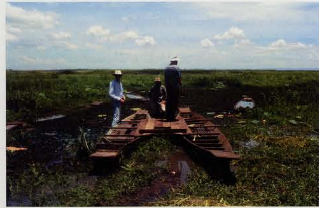
Fig. 1 (left). Swamp plants form an extensive floating mat around the margins of Lake Kumphawapi. This image, looking toward the lake proper, shows one of the open channels maintained by local villagers who use the lake's resources.