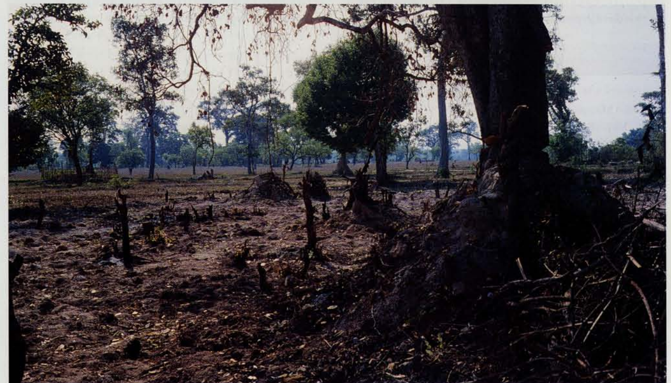
Fig. 7. Fire is used as a tool in both hunting and gathering and in agriculture, even in northeast Thailand today. Here a field near Ban Chiang has been burned to help clear plant detritus during the dry season, in order to prepare for the next planting season. The cause of the evidence for intensive use of fire in the Lake Kumphawapi core beginning about 6500 years ago is a topic of scholarly debate.