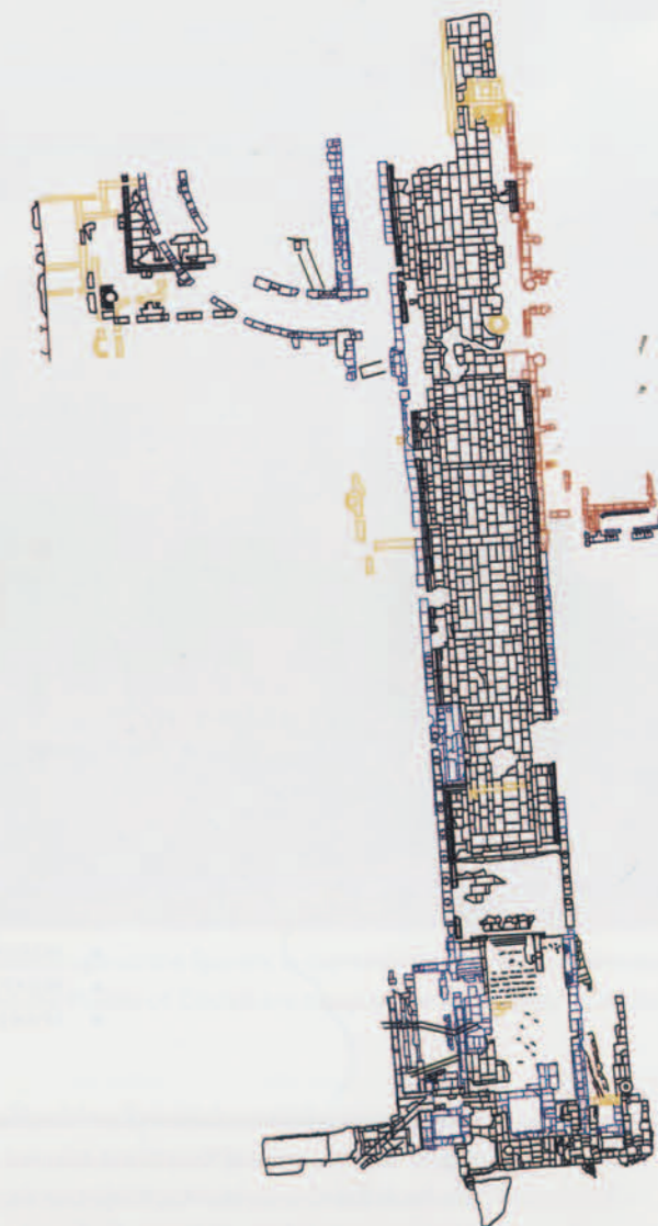
Digitized and rectified actual-state drawing of the Lechaion Road area in Corinth. Colors indicate successive phases of construction in the Roman period.

A totally unexpected result of our study of the Corinthia was the discovery of physical vestiges of a second Roman colony, Colonia Iulia Flavia Augusta Corinthiensis, founded by the Emperor Vespasian in the AD 70s. Previously, this colony was known only from numismatic and epigraphical evidence and had been thought to have been