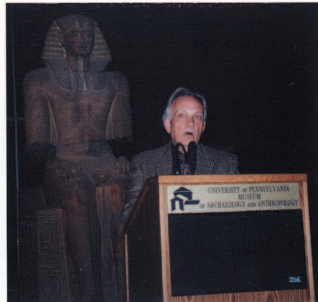
F. Clark Howell gives an address following his acceptance of the Wilton Krogman Award at a UPM reception on April 8, 2000.

the Philadelphia Center for Research in Child Growth (now the W.M. Krogman Center for Research in Child Growth and Development).