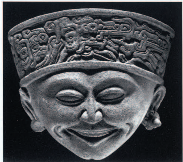
A ceramic "smiling face" from the Remojadas of Veracruz, Mexico, has recently been returned to public display in a new setting in the UPM's Mesoamerican Gallery.

Featuring new text, photographs, and more than 200 artifacts, the renovated gallery is designed to provide visitors with a structured, thematic approach, offering a general overview of cultures of the region and of the principal Mesoamerican civilizations that grew up, flourished, and influenced one another in the region and beyond. The five world-famous grand stone monuments, or stelae, and two monumental circular altars from the Museum's early excavations at the Maya sites of Piedras Negras, Guatemala, and Caracol, Belize, continue to dominate the gallery. Wall and floor cases, some new, introduce visitors to Mesoamerican hieroglyphs, religion, concepts of beauty, everyday life, the Mesoamerican ball game, and architecture and public art.