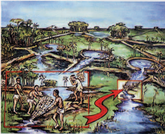
Fig. 3. Pre-Columbian fish weirs and ponds in the savannas of Baures, Bolivia.

scription of fish weirs that are reported in the ethnographic and historical literature on Amazonian peoples. Fish weirs are fences made of wood, brush, basketry, or stones with small openings that extend across bodies of water. Baskets or nets are placed in the openings to trap migrating fish. While most fish weirs are simple ephemeral structures crossing a river or shallow lake, those of Baures are permanent earthen features covering more than 500 square kilometers. In addition, small artificial ponds are