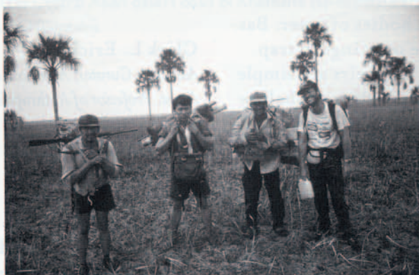
Fig. 1. Archaeologist Clark Erickson (far right) with local guides in Baures, Bolivia.

Baures, a remote region of seasonally flooded savannas, wetlands, and forest islands in northeast Bolivia. He loaned us his Cessna and pilot for an initial aerial survey of the region. As the plane circled the landscape, we saw an amazing web of straight roads, canals, and moated earthwork enclosures below. During the dry season of