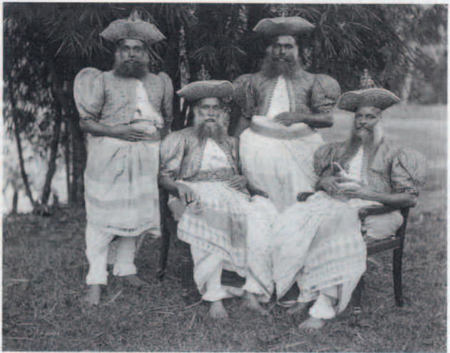
The ancient costume of the Kandyans, the inhabitants of Ceylon (Sri Lanka), replete with cummerbunds, finger rings, and daggers. Photograph by C.T. Scowen, ca. 1898.

Archives. The journals detail the young men's adventures, as well as their ethnographic observations, and include drawings and linguistic notes. They often took their own photographs when visiting remote areas, but they also bought many commercially produced pictures.