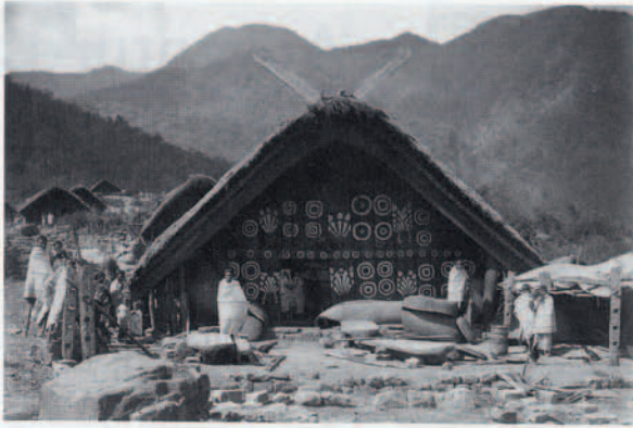
House of the Angami Naga, Assam, India.