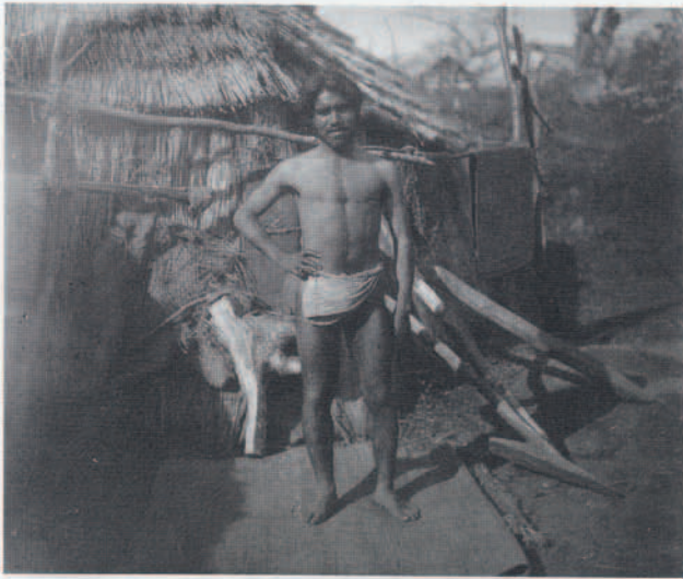
A young Ainu man on Hokkaido Island, Japan, 1901.