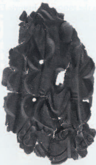
The Willcox plate. The vertical scalloped areas represent the wings of a bird or bird-like creature, and one taloned foot can be clearly seen at the lower left.