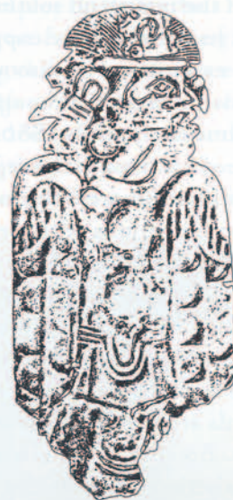
Wulfing Plate A. The winged human-bird creature has talons like those visible on the Willcox plate.

H. 30 cm. Drawing adapted from Virginia Drew Watson, The Wulfing Plates (St. Louis: Washington University Studies n.s., 1950), Fig. 3.