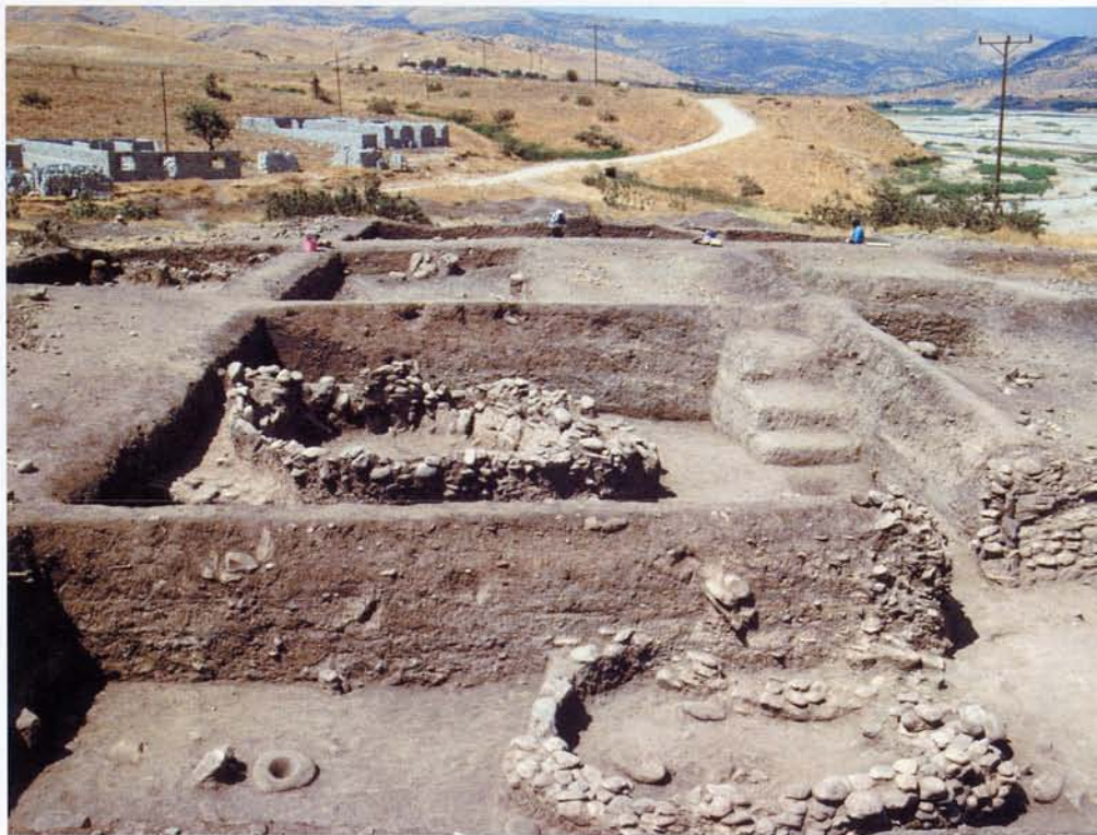
Excavations at Hallan Çemi showing two large huts (center and lower right) and a smaller hut with a flagstone floor. The hut on the right has been cross-sectioned for architectural details.

An unexpected feature was the presence of elaborately carved and decorated stone bowls and sculpted pestles. Vipers, a common motif, adorn some of the bowls. Decorative motifs would become important later, suggesting that the florescence of the later Anatolian