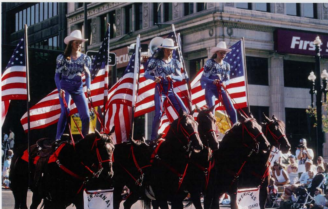
Utah celebrates "Days of '47" with a parade and other festivities on July 24 to commemorate the pioneers' entry into the Great Basin. Patriotism is very much in evidence as young women carry the red, white, and blue.

movement, a populist effort to return to the practices of the early, New Testament church. Persecuted for their innovative beliefs and practices, the Mormons moved increasingly westward before the Civil War to several areas, including Kirtland, Ohio; the area near Independence, Mo.; and Nauvoo, Ill. After Smith was killed in 1844, leadership passed to Brigham Young, who led followers across the Rocky Mountains into what was then Mexican territory. From 1847 on, the church's pioneers settled in Utah's Great Basin area. The land was reincorporated into the United States by the treaty of Hidalgo-Guadalupe in 1848.