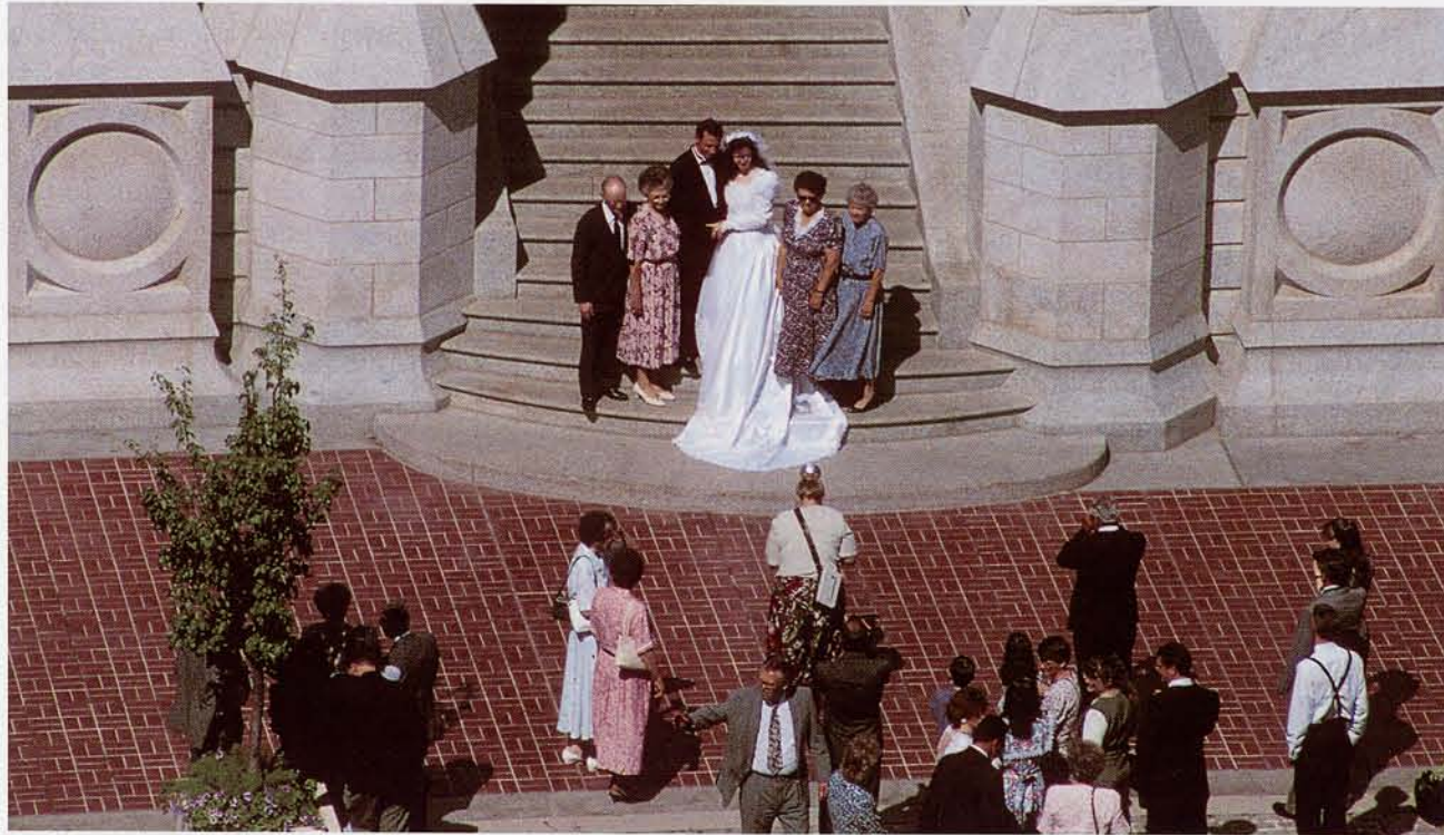
A photographer captures an image outside the Salt Lake Temple of a couple who were sealed in marriage for time and eternity moments earlier in one of the temple's sealing rooms. Temple Square is a popular place for wedding photographs.

church have direct face-to-face relationships with ancestors and descendants beyond even these generational boundaries. The family network of kin, so real to members, also serves as a metaphor for all spirit selves as children of Heavenly Father, and by implication, Heavenly Mother, from eternity to eternity — an understanding that is the basis for the church's extensive genealogical program.