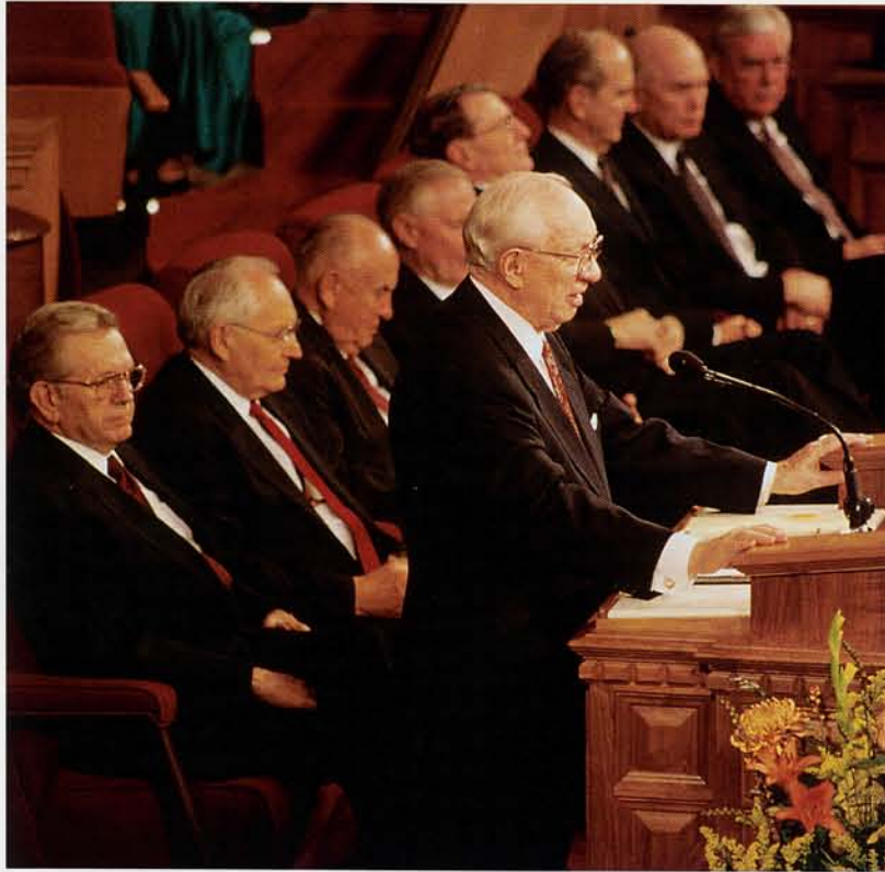
At the General Conference in October 1994, today's president, Gordon B. Hinckley, was presiding during the vote to sustain Howard W. Hunter as prophet, seer, and revelator. President Hunter died about five months later and was succeeded in that office by Hinckley. In the row behind him are members of the Quorum of the Twelve.

worship, but rather places where living members perform vicarious "work for the dead," consisting of proxy baptisms, endowments, and sealings for deceased ancestors. This temple work is guided by a belief that all persons who have ever lived on earth are the spirit offspring of divine parents to whom they may return as worthy of a heavenly glory if these ordinances are performed under priestly authority. The spirit of the deceased person may accept the ordinance work that is done on earth on their behalf. Many forms of service