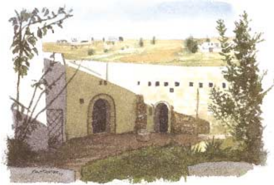
An interior view of Al Hosh's restaurant and café, housed in a renovated farmhouse with vaulted ceilings and interior courtyards

unspecified time frame and because of the focus on everyday life. Visitors to a prehistoric city or a medieval castle experience the boundaries and the foreignness of antiquity. However, a cup of coffee and game of backgammon in a café simulating a recent and ruralized past does not seem as distant or foreign — it is likely to be easily imagined and more completely integrated into the patron's experience of the place. But the recent appearance of many such places is not simply a function of an idealized nostalgia. As it is elsewhere, the phenomenon of heritage cafés in Jordan is best understood as related to recent social change and movement — transnational movement, urban-rural movement, and movement across boundaries of both class and gender.