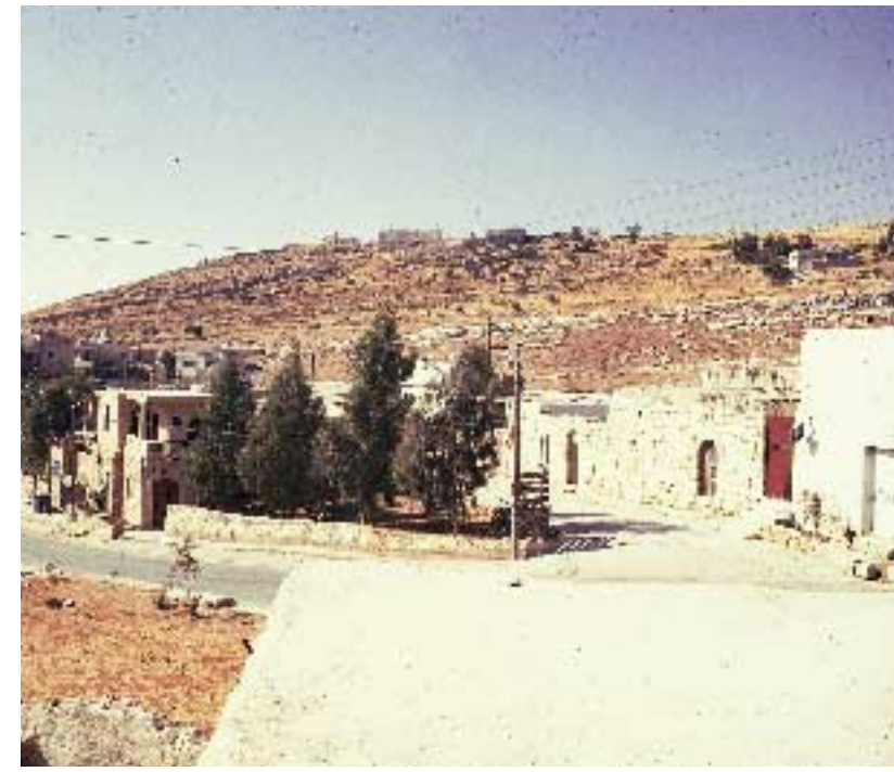
A concentration of houses of the old core of Fuheis's agricultural village that have been renovated and converted into a café-and-gallery complex. These buildings are examples of 19th- and early 20th-century rural architectural styles in Jordan.

In the cafés we've described, heritage provides more than a temporal link between past and present. It links space — rural, urban, and transnational — and spans the social