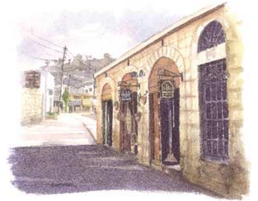
An exterior view of Fuheis. In the 1990s private investors developed a section of the old village into a café-and-gallery complex.

Kan Zaman, whose name is translated for tourists as "Once Upon a Time," was originally a 19th-century farming estate, but it has undergone a tourism-inspired renovation as an "Ottoman Village." The estate now houses a restaurant, a coffee shop, an art gallery, handicraft studios, and gift shops. The entire complex is decorated with relics of agricultural and Bedouin life; patrons are offered an array of "traditional" food, drink,