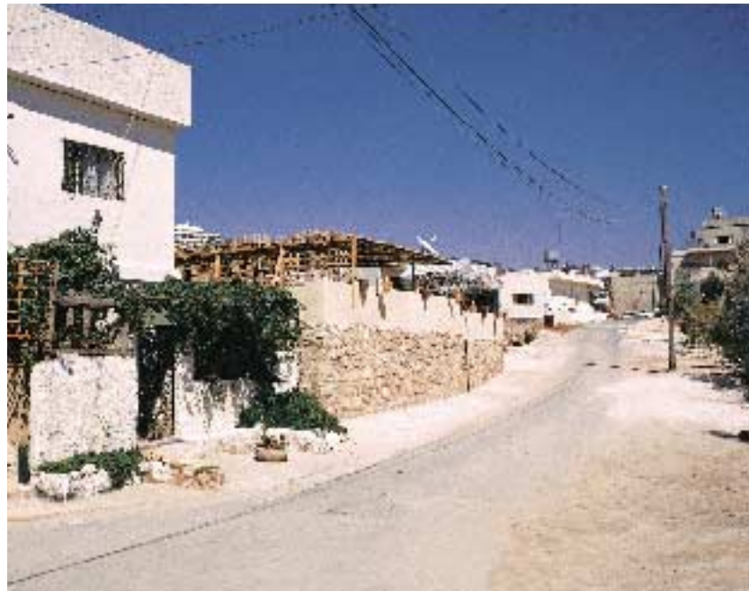
Two views of one of the houses in the renovated core that was transformed into a roof terrace for Al Hosh