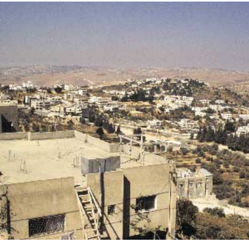
Fuheis has experienced considerable new construction and growth as the capital city of Amman spreads toward the town.

west of the present Orthodox church where a Muslim sheikh and his associates were slain by members of a Christian group because the sheikh insisted on marrying the priest's daughter. Later, after holding services in magharit er'ebaeh (a large cave in this area), the girl's father asked his parishioners to step on his neck as they left the chapel. As they did so, he prayed that God take his daughter from him to assuage his feelings of shame. As legend has it, he returned home to find his daughter dead. In a less dramatic association with historical landscapes, the older generation of townspeople still recall the importance of the area's natural springs as focal points for community activity as late as the 1950s.