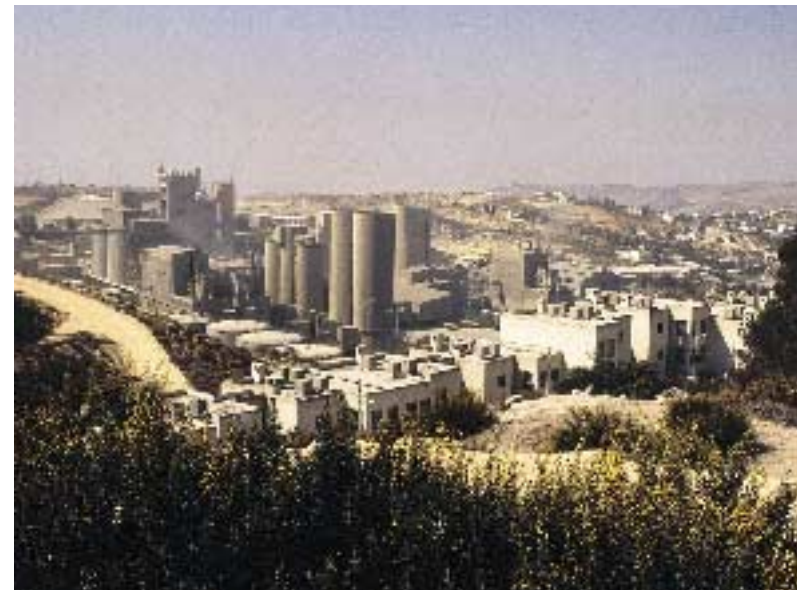
LEFT: The most densely populated section of town now surrounds Fuheis's cement factory, built between 1952 and 1953. RIGHT: Fuheis, with its renovated historic core shown in the middle

This expansion of the capital toward Fuheis has had significant impact on the town through rising land values, new residential construction for commuters from the city, and