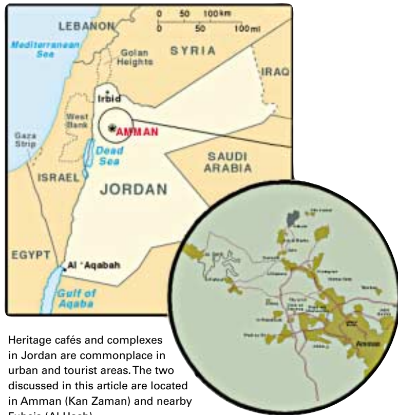
Heritage cafés and complexes in Jordan are commonplace in urban and tourist areas. The two discussed in this article are located in Amman (Kan Zaman) and nearby Fuheis (Al Hosh).

accompanied by some Arabic music after a heavy shopping session. The coffee in the café costs twice the regular price, but then you are paying for ambience. It's a curio of sorts. . . It lies outside of Amman along the airport highway. . . The "village" is off to the left after a couple of km. Watch for the "Coca Cola" billboard.