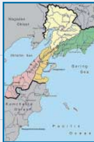
The Kamchatka Peninsula. Administratively, Kamchatka is divided into two major regions, the Kamchatka Oblast' [Province] and the Koryak Autonomous Okrug [Region] (KAR). The KAR is further divided into four Raions [districts]; the Karaginskiy (orange), Tigil'skiy (pink), Olyutorskiy (green), and Penzhinskiy (yellow). The administrative centers of these districts are indicated with red dots, with Palana being the capital of the KAR, and the other major villages with black dots.

Sometime later, in the late 19th and early 20th centuries, Franz Boas led a series of joint Russian-American expeditions into this region of northeastern