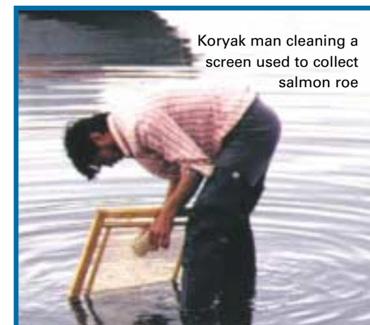
Koryak man cleaning a screen used to collect salmon roe

residents were being tended on the tundra near the interior mountain range, where they graze for most of the summer. However, there was clear evidence that a reindeer had been recently slaughtered