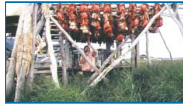
LEFT: Koryak man hanging lines of cleaned salmon to dry; CENTER: Koryak woman cutting up sea lion blubber; RIGHT: Reindeer meat drying on rack in reindeer camp near Voyampolka

In addition to this, both Koryaks and Russians actively collected the eggs from gravid females to sell as caviar. Koryaks would typically receive 10 to 20