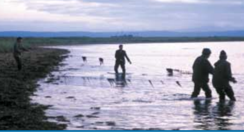
LEFT: Koryak men netting salmon in Karaga River; RIGHT: Koryak woman stringing up gutted salmon