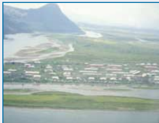
LEFT: View of Tymlat from helicopter; RIGHT: Fishing hut on a beach near Karaga