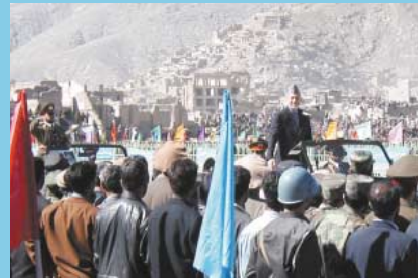
TOP: President Karzai, closely followed by Defense Minister Fahim, opens the April 28 parade.

The guns did come, but not the clear victory Masood sought. Years, then decades passed without resolution. Total commitment became tinged with sadness, and thus emerged a fourth iconographic mood: Masood beyond normal consciousness, lost in thought, bearing a sorrow too great for other men. Posters of this sort outnumber all others. In one of them he looks past the camera: lips parted, brow deeply furrowed,