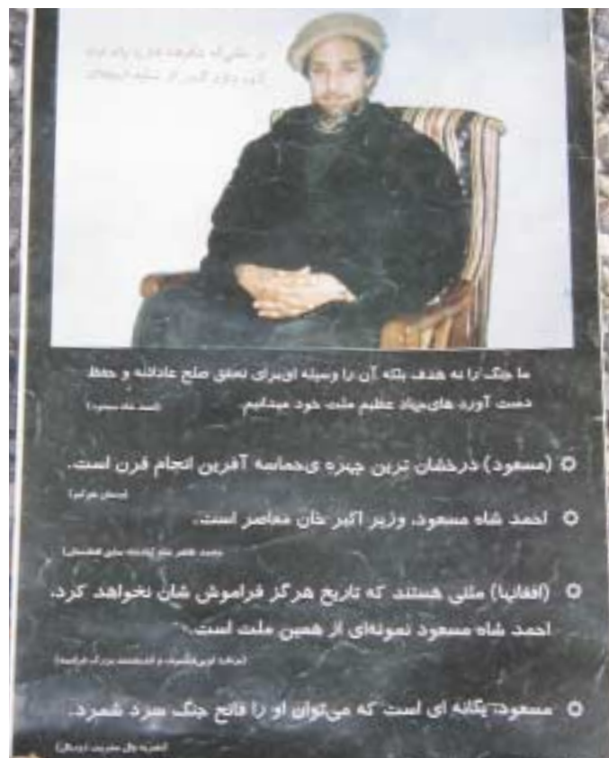
TOP: Posters of Masood for sale at a Kabul kiosk. The larger portrays Masood as genial and relaxed. BOTTOM: Masood the formally seated statesman, complete with testimonials

that day in a dozen variations, both bolstered and challenged national identity. It also recalled a Philadelphian's contributions to symbolic anthropology. At issue: Would the post-mortem cult of Masood revitalize Afghanistan or wreck it?