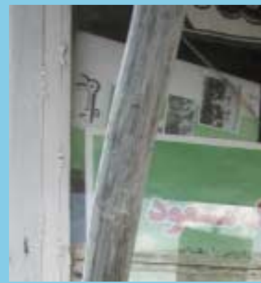
CLOCKWISE (FROM LEFT): Displayed in a Kabul shop window, Masood prays with fellow mujahedeen . While most Afghan carpets are traditionally geometric, Masood iconography has assumed woven form. Intense and questing, this image of Masood typifies his most remembered qualities.

defense of Afghanistan, the defense of Islam, the defense of our oppressed people, and the exaltation of our country. There's never been anything else." Another poster depicts a calm, almost majestic Masood — a second dimension of iconographic temperament — seated formally with folded hands in an upholstered chair. Below the picture are one-line testimonials to him from an eclectic array of sources including Zahir Shah (the former Afghan king), British scholar Bernard Lewis (charmingly misidentified as a "great French philosopher and thinker"), and the Wall Street Journal .