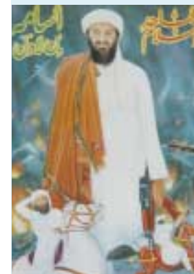
An early 2001 poster of Osama bin Laden ("Holy Warrior of Islam") from Peshawar, Pakistan.

Representing life forms, especially humans, has sometimes been condemned as behavior that blasphemously mimics divine creation itself. In this reasoning, now considered extreme, the act of portraiture borders on the assumption of godly powers; the artist thus risks being