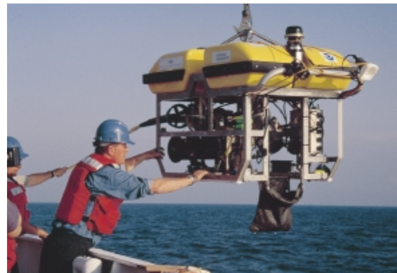
Dr. Robert Ballard retrieves the ROV Little Hercules from the depths of the Black Sea.

Finally, in the cold and damp early hours of the morning, after Dr. Ballard had boarded a plane for the States, we found it: a nearly intact ship sunk into the seafloor with its