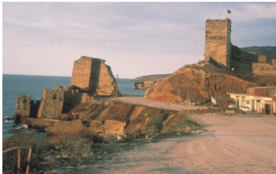
The city walls of Sinop, Turkey, date to the fourth century A.D. The Black Sea Trade Project excavations are located under the tower on the right.