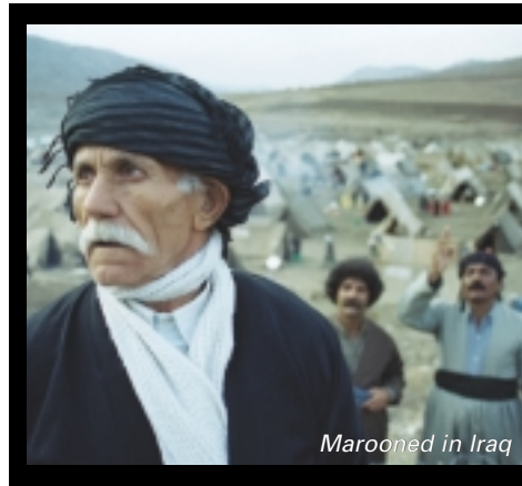
Marooned in Iraq

At root, Mondays in the Sun explores the bonds that hold people together while they respond to their situation in a very Spanish way — by getting on with their lives. The directing and the lensing are ever searching out those tensions and boundaries that define a person's dignity. In the end, the principals are literally left floating, as the men attempt to take control of their lives and instead find themselves marooned on a boat in the middle of Vigo Bay,