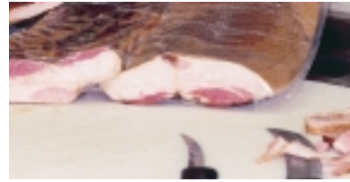
RIGHT: Trimming the bacon to go into the slicing machine; BOTTOM LEFT: Putting the bacon in the slicing machine; BOTTOM RIGHT: Examining the results

Vermont Smoke and Cure is the name of the processing plant Murphy purchased to help him supply his restaurant with local