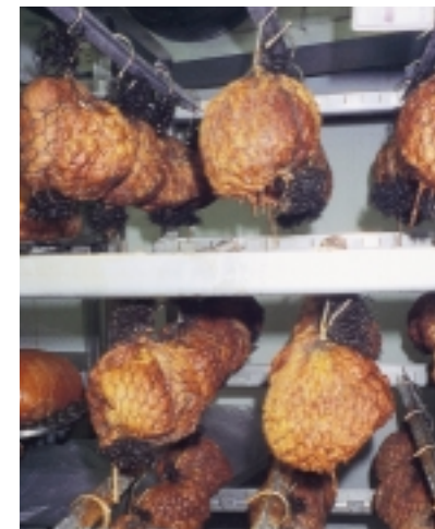
TOP LEFT: The Hamburger Deluxe at the Farmer's Diner; TOP RIGHT: In the kitchen at the Farmer's Diner; BOTTOM LEFT: The restaurant; CENTER AND BOTTOM RIGHT: Hams in the smoker