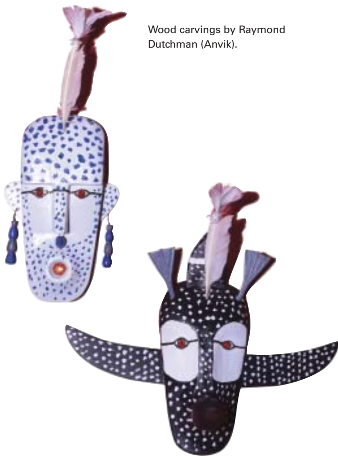
Wood carvings by Raymond Dutchman (Anvik).

Baskets, for example, were sometimes dipped in mercury. Today, we know that many of these treatments are toxic, and they are no longer used. Unfortunately, early record-keeping was less than adequate, so it is difficult to know, without expensive testing, which objects were given which treatments. This is a special concern for Indian peoples who may want to reintegrate sacred objects and objects of cultural patrimony into their ceremonies. Some tribes, such as the Hupa of California, are taking the lead in devising decontamination procedures.