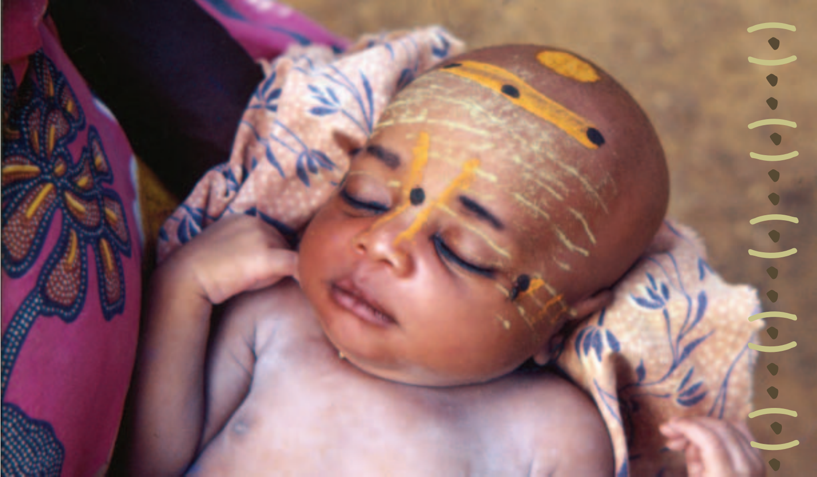
This baby's mother has spent much time applying medicinal herbs and protective jewelry on her child.

grooming their babies, applying herbal medicine in attractive designs, and cleaning the baby's jewelry to make it sparkle, so as to "seduce" potential babysitters into offering their caretaking services to an irresistibly beautiful baby. A mother may hand her baby to her morning babysitter knowing that the latter is likely to pass the baby to another person if she becomes tired, or the baby fusses, or another person requests the child. Such casual comings and goings are meant to convey to children a feeling of safety, socializing them to feel comfortable with transfers of caretaking responsibility.