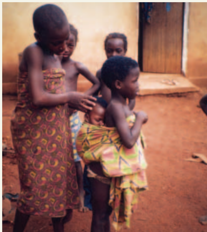
One girl helps another tie a baby onto her back.

Beng mothers of infants try to create a reliable network of several potential babysitters who can care for their infants while they work. In addition to offering a practical benefit to the mother, this babysitting network is also meant to make the child feel loved by many, helping the infant resist the lure of wrugbe . One way a mother attracts a large pool of babysitters is to make the children as physically attractive as possible. Mothers typically spend an hour every morning and evening