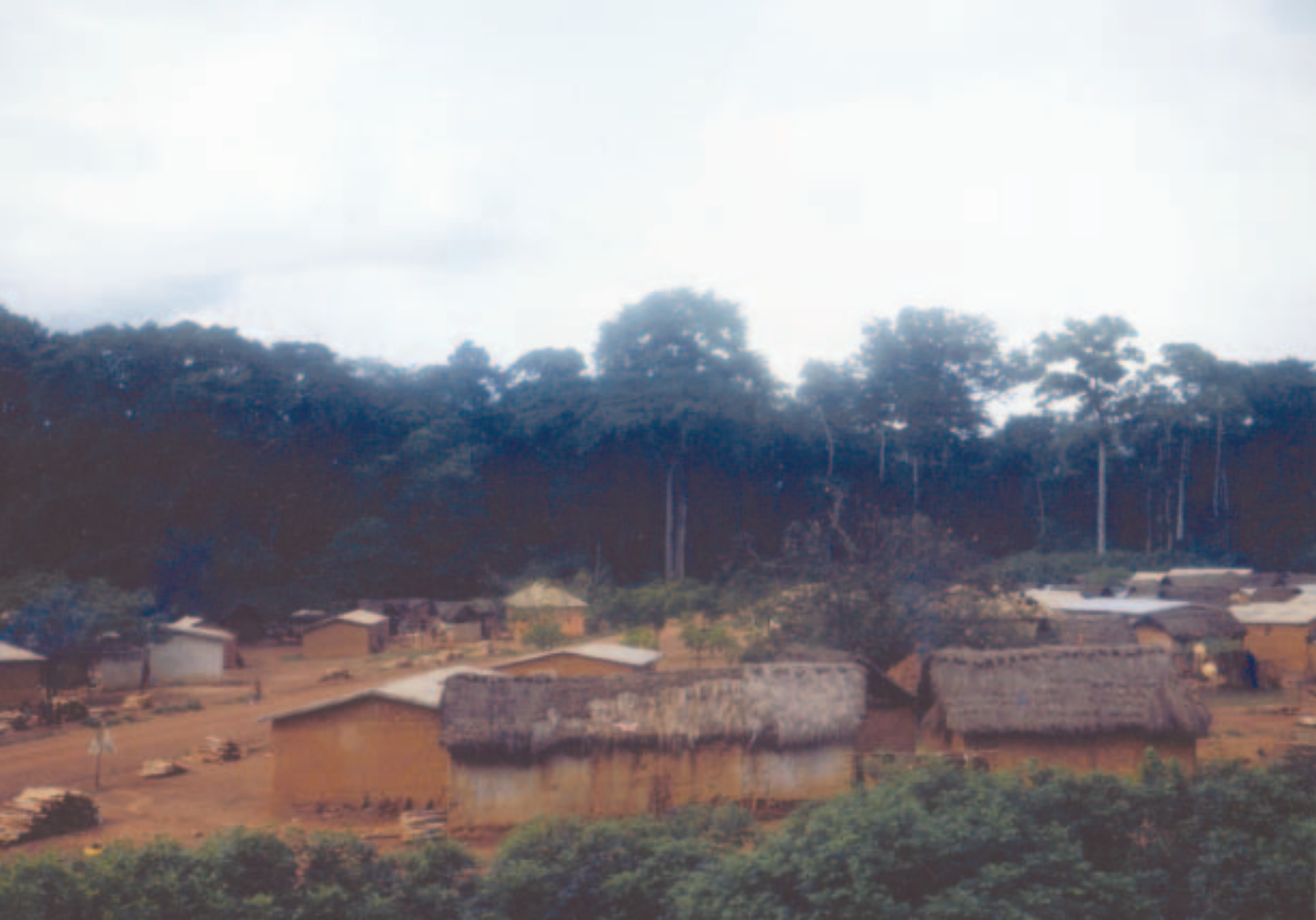
A Beng village.