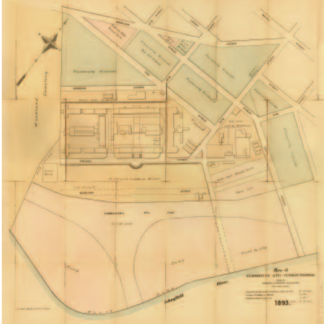
1893 Map of Almshouse and Surroundings showing the location of the Public Bath House on South Street, the Water Department Storage Yard to the east (below), and the unlabeled Blockley or Almshouse Lane to the south (left).

Several other structures were also slated for demolition. At the corner of 34th and Spruce Streets, there was a small frame house occupied by an official of the Almshouse. To the south stood a much older house and a large stone barn, both