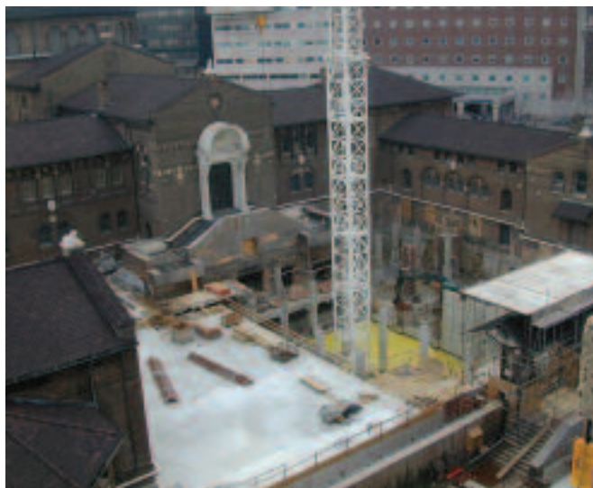
The upper courtyard, also known as the Warden Garden, during construction, March 2004. The line of white pipe along the walls of the Museum indicates the approximate position of the courtyard’s former ground level. The bases of the columns (center) mark the deepest part of the excavation, some 30 feet below. These concrete columns support the roof deck, already in place on the east (left) side of the courtyard. Joseph D. Boaen

The site lay between 34th Street on the west and the Pennsylvania Rail Road to the east and between Spruce &