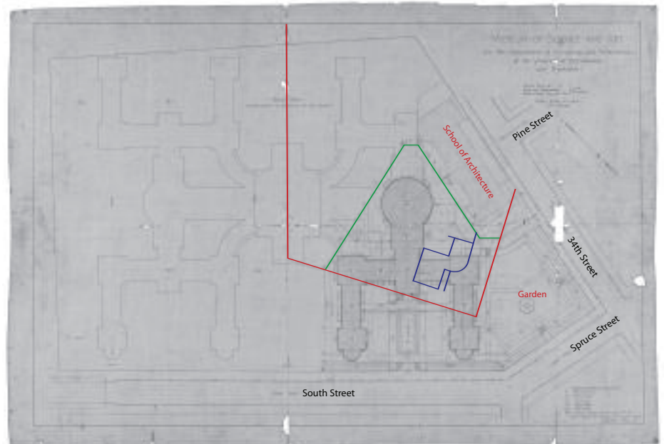
Inverted blueprint of the proposed block plan from June 13, 1896, with the four-acre site, the barn site within it (green line), and the first part of the Museum to be built. The barn is still indicated (in blue) as are some contour lines showing the land falling away west to east (right to left).

digging in this courtyard? Since parts of the eventual Museum site and its surrounding area had been used over time for dumping, the household debris—the ironstone china fragments, the coal, and the ash—probably resulted from this activity and simply became incorporated into the site fill along with the construction workers' debris. Though not directly indicative of the Museum site's previous occupants, finding these remains and putting them together with the documentary and photographic record available from the University of Pennsylvania Archives and the Museum Archives, we have gained a picture of what was there before the Museum. 🏠