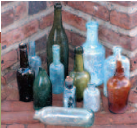
Above: Bottles found in the construction site. Below: Ironstone pottery fragments, some imported from England, found in the construction site.