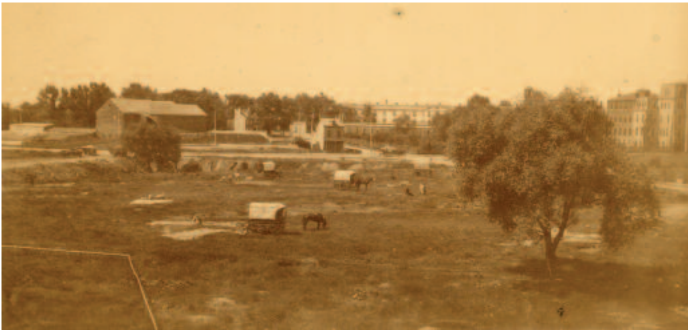
Looking south at the Almshouse complex. The barn and children's asylum are to the left, the frame house is on the street corner near center, with the main Almshouse in the background and the University Hospital at right.