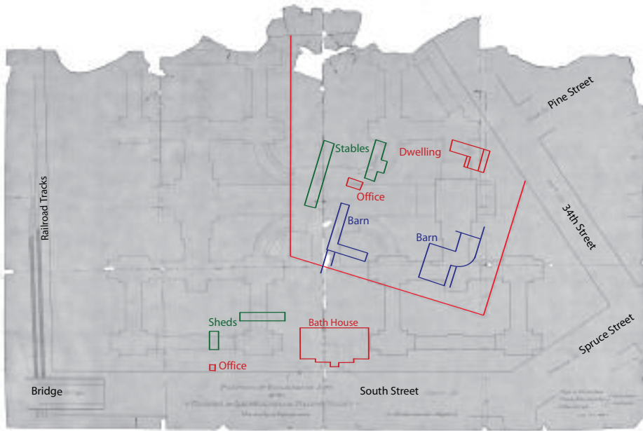
Inverted blueprint of the proposed block plan for the full Museum from July 12, 1895. At center bottom is the public bath house. The barns, the stables, and the dwelling that served as the Almshouse children's asylum are also noted within the four-acre site surrounded by a red line.

indicates the outline of the four-acre site, and within that the barn site, but the proposed School of Architecture is gone. The Museum courtyards and the garden on the west side are now labeled “Park and Botanic Gardens,” a reminder of the stipulations in the 1894 ordinance. Three months later, in April 1897, the contractors began clearing the site to begin construction of the Museum.