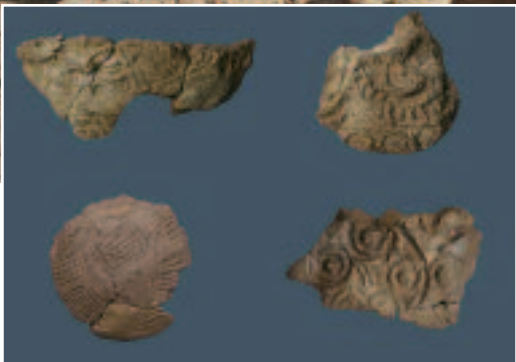
Above, a public building at Gilund with parallel walls and a bin in which seal impressions were found. Left, four seal impressions from Gilund.

Having divested himself of his entire archaeological infrastructure, Possehl, of course, soon found himself enticed back into the field by Vasant Shinde, his colleague from Deccan College (India). Since 1999, they have been excavating at Gilund, a Bronze Age site of the Ahar Banas Complex, in Rajasthan in northwestern India. One of the recent, exciting discoveries was a bin in a public building that contained 100 seal impressions dating between 2100 and 1700 BC. The designs used suggest links between Gilund and the Indus civilization, as well as with groups farther to the northwest in Central Asia and Afghanistan.