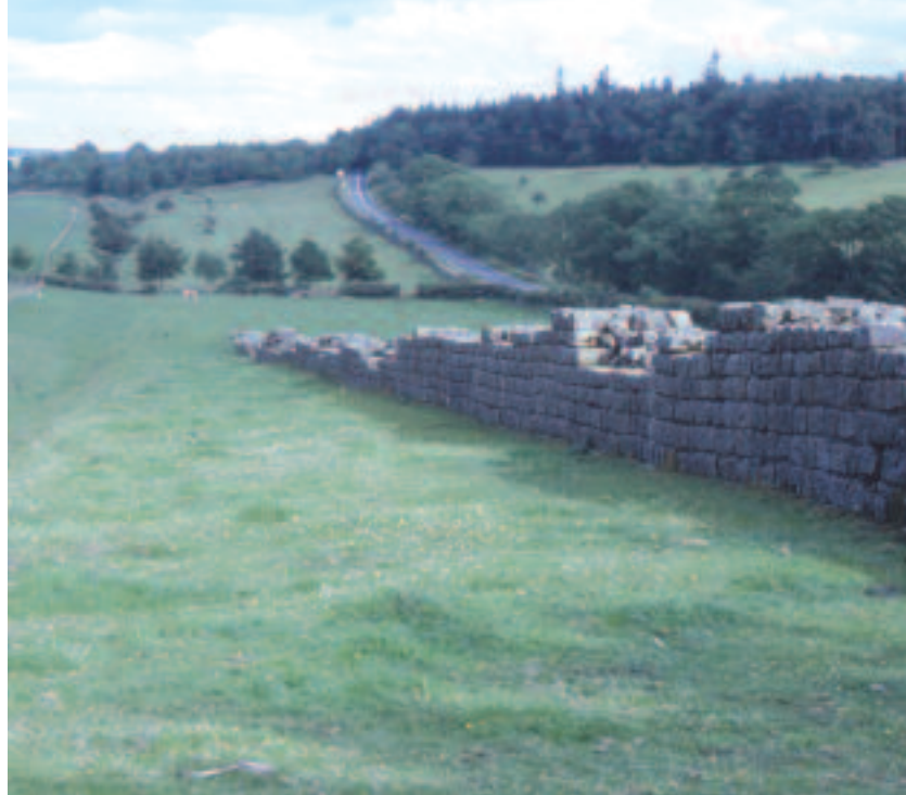
Hadrian's Wall at Black Carts, view looking east from just north of the wall. The level berm is visible in the center, the outer ditch at the left.

territory north of the Alps. In 15 BC, legions led by Tiberius and Drusus conquered the lands south of the Danube River in what is now southern Bavaria, making the Rhine and the Danube the frontiers of the Roman Empire in northwestern Europe. Shortly after the conquest, the Roman military began constructing bases along the Danube. Regensburg became the largest and remained the principal Roman military and civil center of the region until the 5th century AD. In the AD 80s under the Emperor Domitian, the triangle of land between the upper Rhine and upper Danube was added to Roman terri-