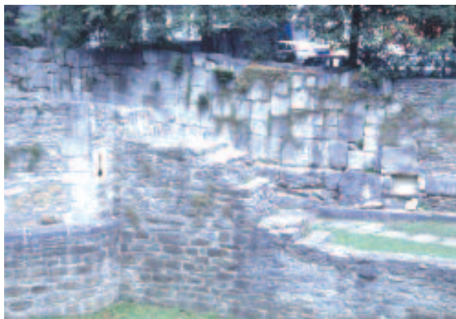
The walls of the fortification at Regensburg were built of unusually large stone blocks. This view shows the southeast corner of the Roman fort, excavated in the 1950s and 1960s. The medieval wall in the foreground, of smaller stones, dates to around AD 1383.

territory north of the Alps. In 15 BC, legions led by Tiberius and Drusus conquered the lands south of the Danube River in what is now southern Bavaria, making the Rhine and the Danube the frontiers of the Roman Empire in northwestern Europe. Shortly after the conquest, the Roman military began constructing bases along the Danube. Regensburg became the largest and remained the principal Roman military and civil center of the region until the 5th century AD. In the AD 80s under the Emperor Domitian, the triangle of land between the upper Rhine and upper Danube was added to Roman terri-