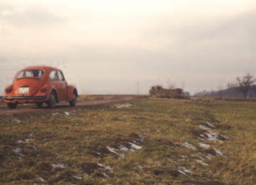
The Limes in southern Germany, showing remains of a stone tower (in the distance) associated with the defenses.

We can see ruins of stone-built structures (in some cases partially restored today) along both walls. Created during what is known as the Early Roman Period, both walls slice through the countryside, seemingly undeterred by obstacles that earlier Iron Age builders and later medieval builders avoided. For example, one stretch of the Limes , between Walldürn and Welzheim, is straight over a distance of 80 km (50 miles).