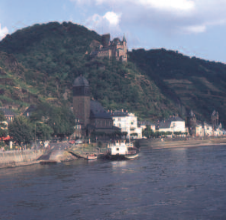
Between Caesar's conquest of Gaul (58–51 BC) and the construction of the Limes boundary (AD 120s), the natural rugged topography of the middle Rhine valley formed a barrier to major movements by potential raiders into Roman territory. This view shows typical middle Rhineland topography on the eastern bank at St. Goarshausen, with the later medieval castle, Burg Katz, on the slope.