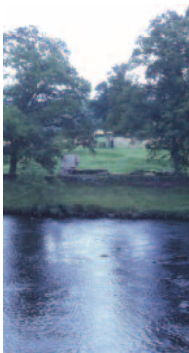
Hadrian's Wall crosses three rivers. Remains of the wall and bridge are visible at the Roman fort at Chesters where it crosses the River Tyne.

The role of the Limes and Hadrian's Wall as monuments to Roman power should not be underestimated. Surrounded as we are today by monumental architecture—skyscrapers, enormous bridges, and great cathedrals—these Roman walls may not strike us as unusually grand. But in the northwestern European landscape of the first centuries AD, they were very impressive. No other structures extended for such distances or cut such remarkable swaths through the countryside. These walls were material manifestations of the central message that Rome wanted to communicate to the peoples beyond its provinces—Rome's power is not threatened by barbarians across its frontiers.