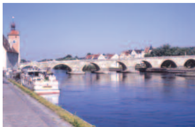
The Danube River at Regensburg. The Danube remained the boundary between Roman territory and the unconquered lands from 15 BC until the collapse of the Empire during the 5th century AD. The 12th century medieval bridge in this photograph links Regensburg (left) with the north bank of the river.

The two walls were built at roughly the same time, though their precise chronologies are extremely complex because they were constructed in phases over a number of decades. Roman armies under Julius Caesar conquered Gaul (modern France and lands farther to the northeast) between 58 and 51 BC, making the Rhine River the eastern boundary of Roman