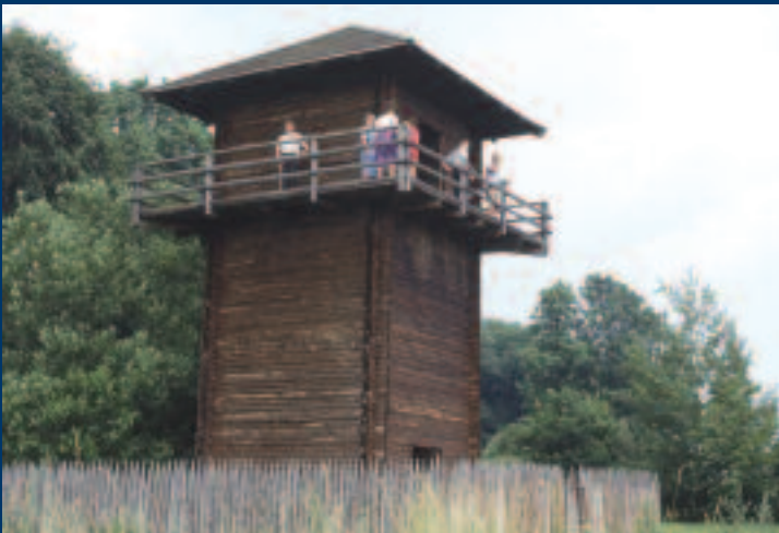
Reconstructed watchtower along the Limes at Hienheim, 26 km upstream from Regensburg on the Danube.

Roman citizens)—are believed to have been stationed in the forts and watchtowers along the Limes , around 10,000 on Hadrian's Wall. Civilian settlements grew up near many of the bases. In the relatively few cases where these settlements and their cemeteries have been systematically excavated, archaeologists have been able to learn much about interactions between the Roman military and native peoples of the region.