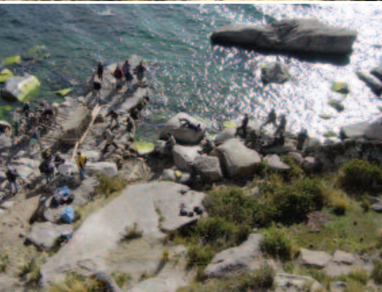
Top, under sail, the boat gradually gained weight as its reeds absorbed water. Middle, Caesar Kalisaya stands next to the 9-ton stone—about the size of Tiwanaku’s Ponce monolith—chosen for the trip across the lake. Bottom, the Aymara constructed a ramp to load the 9-ton stone onto the boat.