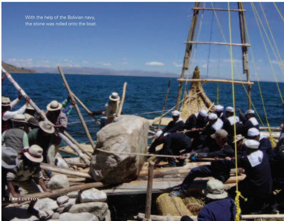
With the help of the Bolivian navy, the stone was rolled onto the boat.

Our destination was the hamlet of Santa Rosa on the Taraco peninsula, the shore closest to Tiwanaku where archaeological evidence indicates the stones were offloaded. A 13 m wide canal dating from the Colonial period (if not earlier) allowed us to