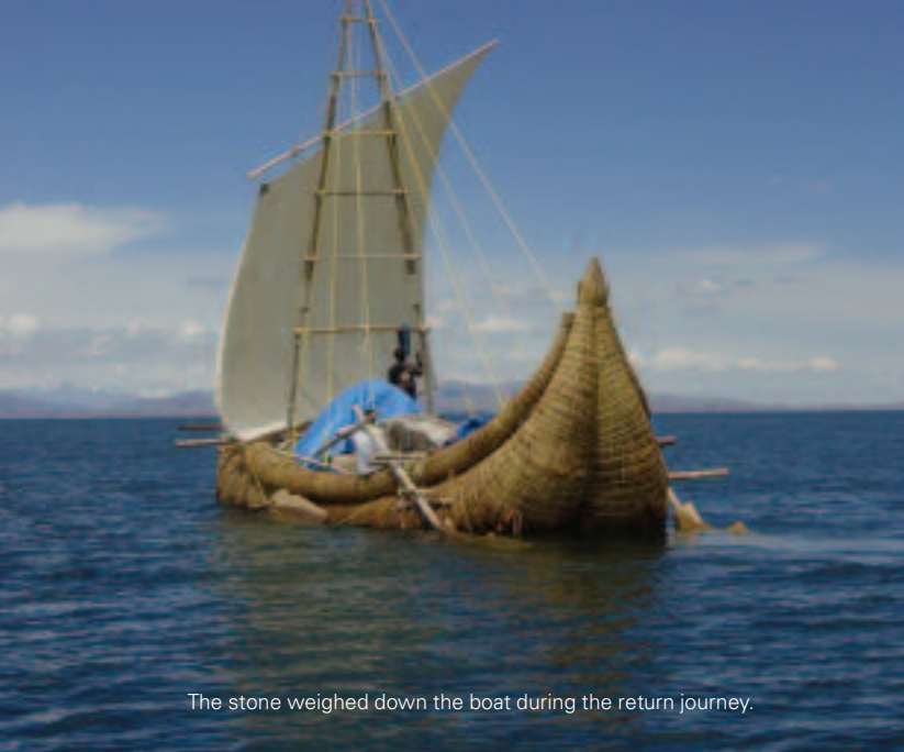
The stone weighed down the boat during the return journey.

sail directly into the shelter of its banks. Soon after we arrived, the town’s leaders came to greet us. They were enthusiastic and hospitable. They placed a bridge of eucalyptus between the boat and the bank of the canal, drew ropes around the stone, positioned levers, and lubricated the bridge with water. With about 50 people—men, women, and children—they rolled the stone off the boat and moved it 60 m up the bank in less than an hour with no organization from our team.