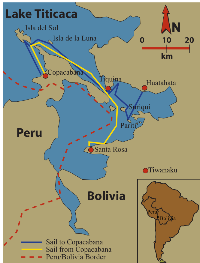
Lake Titicaca sits in a huge geological depression 13,000 feet above sea level in the Andes. Its surface area is 8,563 km 2 , making it slightly smaller than the Mediterranean island of Cyprus. The most substantial body of fresh water in South America, it straddles the border between Bolivia and Peru.

The answer lay in the vibrant local Aymara Indian communities surrounding Lake Titicaca’s shores and that still make small boats not from wood, but from a lakeshore reed known as titora . Typically 2-7 meters long and a third as wide, these