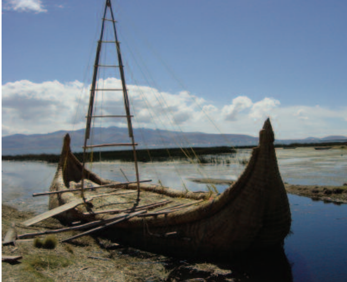
After its journey, the boat rests at Santa Rosa.