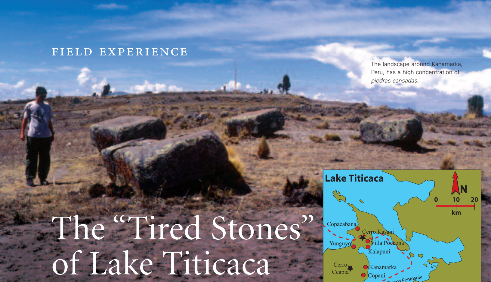
The landscape around Kanamarka, Peru, has a high concentration of piedras cansadas .