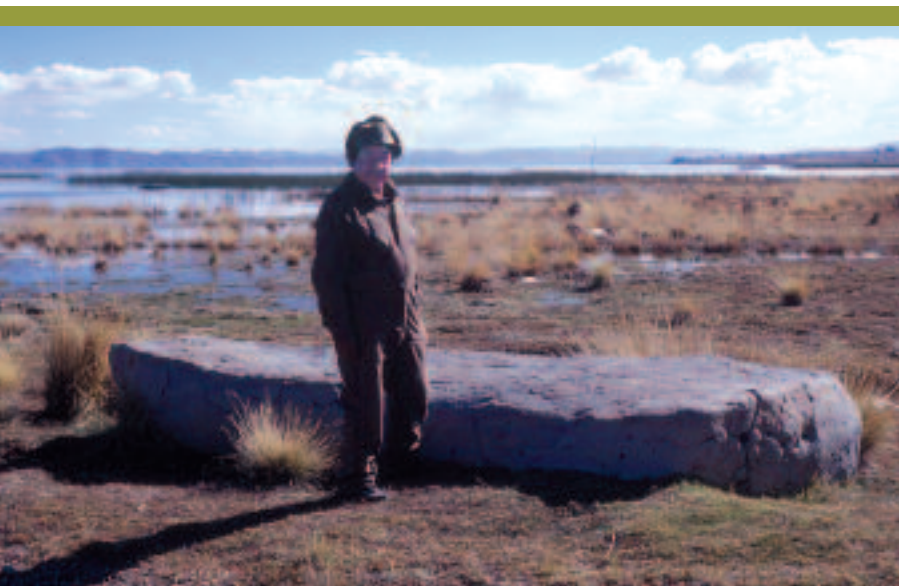
Piedras cansadas are found along the Bolivian shore of Lake Titicaca at Iwawi. Like many at Tiwanaku, they have regular circular pockmarks across their surface where hammerstones were repeatedly bounced to shape them.