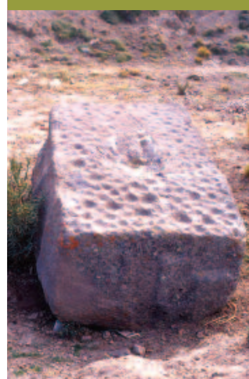
A piedra cansada near the village of Copani exhibits the distinctive pockmarks of bounce working. We also identified sherds of Tiwanaku-style pottery in a nearby field.