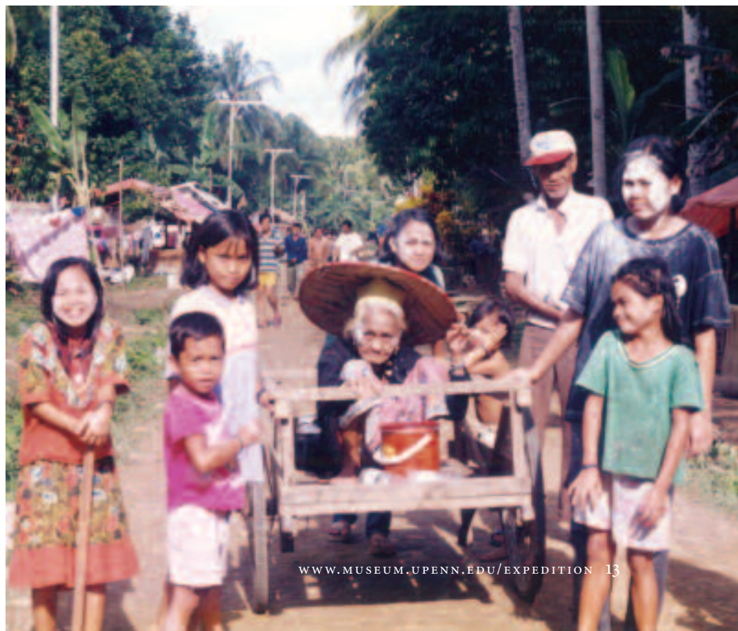
This grandmother was transported to the tiwah celebration by her grandchildren.