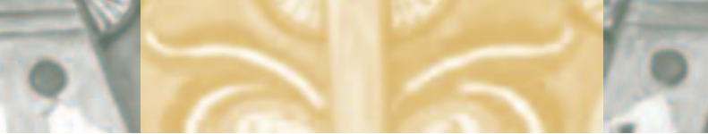
New bone repositories are constructed.