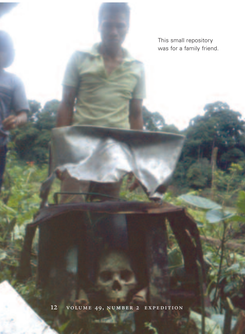
This small repository was for a family friend.

The dead look forward eagerly to taking up residence in the Prosperous Village. If the time between their death and their tiwah goes on too long—a situation that arises while the family accumulates the resources needed for the tiwah —the souls