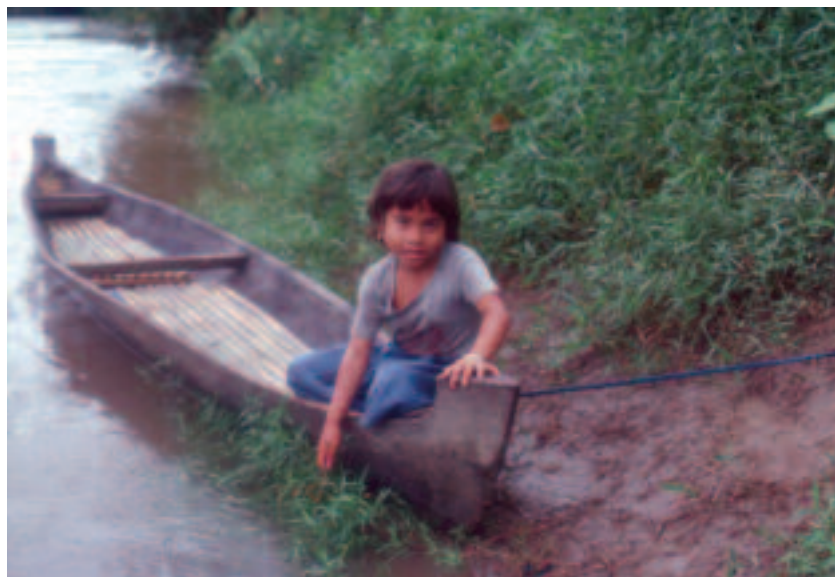
Small canoe-like boats are used for travel between homes and rice fields.

A good example of how the concept of family operates in everyday life (and in death) is found among the Ngaju Dayaks. The Ngaju are the largest indigenous group in Central Kalimantan Province, where they live in small villages along rivers in the rainforest, farming, fishing, and hunting wild game. Although most of them today are Christian and a few have converted to Islam, a proud minority continue to practice their traditional faith—Kaharingan—which involves belief in a high god with male and female dimensions, as well as a host of other good and evil supernatural beings.