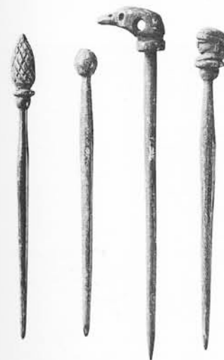
Ornamental ivory hairpins typical of those used by Roman women of the Imperial period.

These are scattered details, however, which might best be understood if we imagine the step-by-step concerns of a typical Roman patrician at her toilette. First she would probably pluck her eyebrows with small bronze tweezers. A salve of soot and oil of sesame was applied afterward to