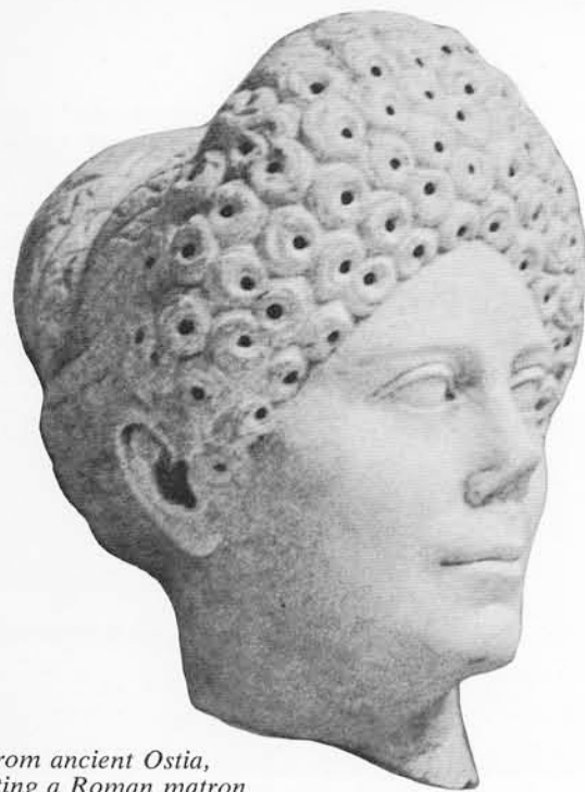
A bust from ancient Ostia, representing a Roman matron wearing a typical Flavian hair-do.

a haunt for prostitutes and no fastidious lady could chance being confused with these cheaper rivals for the attention of men. And so it was the servile confidante who trotted back from each shopping trip laden with creams and perfumes sealed in delicate jars of alabaster and misty-thin glass.