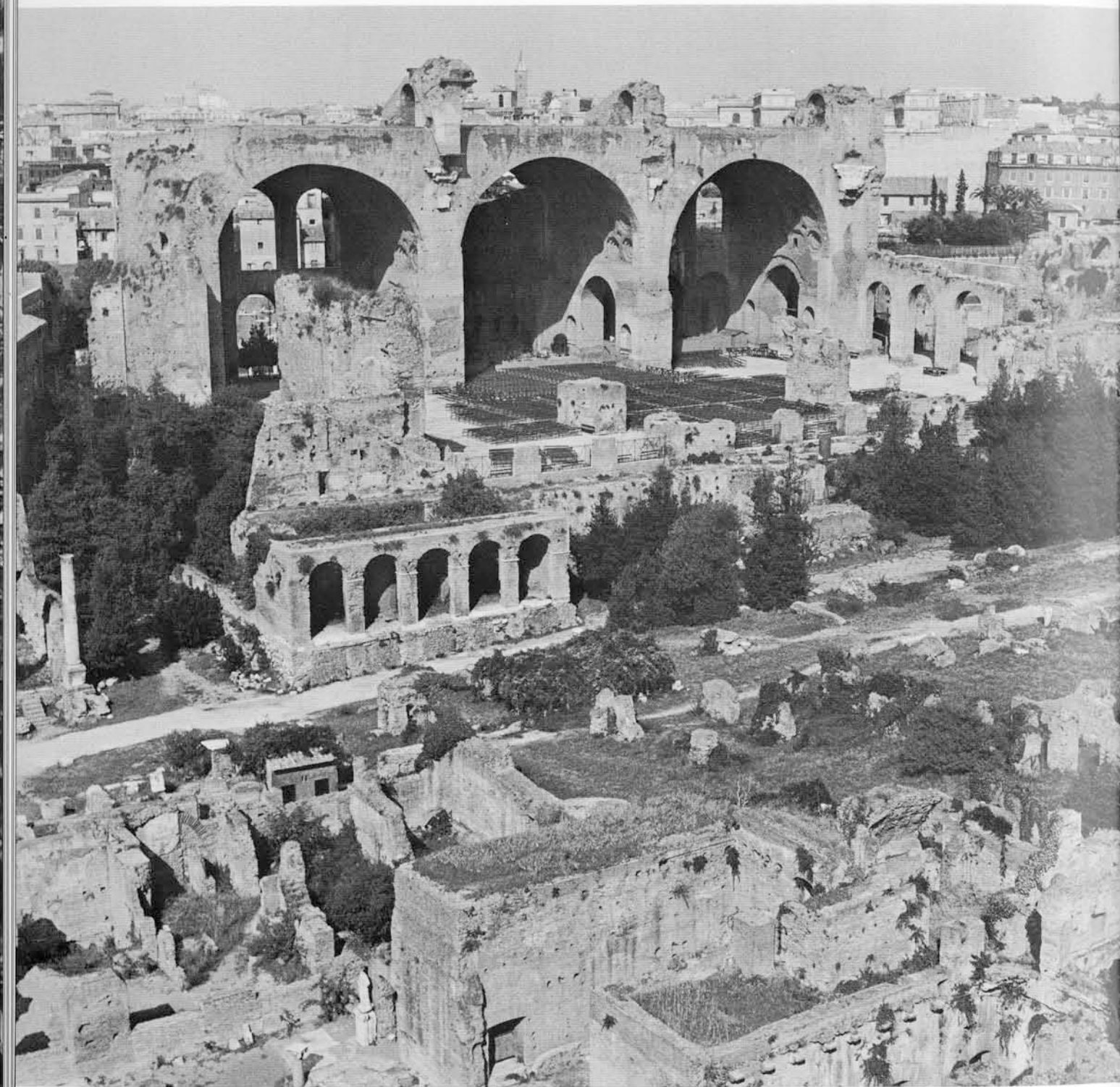
View of Rome with the eastern portion of the Sacra Via in the middle distance. At the right, beneath the trees and the floor of the Basilica of Maxentius, are the remains of the Horrea Piperataria, a warehouse for spices and exotic imports from the East.