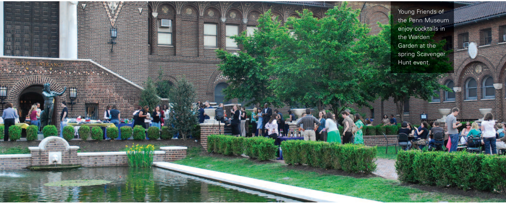
Young Friends of the Penn Museum enjoy cocktails in the Warden Garden at the spring Scavenger Hunt event.