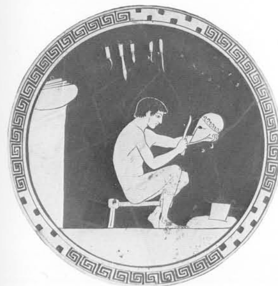
Design on the interior of an Attic red-figured kylix in the Ashmolean Museum, Oxford. An armorer sits on a low stool finishing with a file a helmet which he holds in his left hand. Behind him are melting pot and furnace; in front, an anvil; and above, a row of knives.

need for such an arrangement. This is the reason why many helmets have crudely punched holes in the lower corner of the cheek pieces, indicating the use of thongs which could be laced to hold the helmet securely on the head. Such holes are discernible until the last quarter of the sixth century, when this type of helmet lost its original function and was worn farther back on the head. Here is another indication of a practical shortcut by a local armor-smith which was never used on Corinthian helmets from Greek soil.