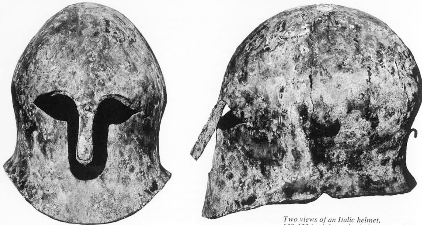
Two views of an Italic helmet, MS-1534, of the early sixth century B.C., in the University Museum.

He spoke, and flashing forward laid hold of the horse-haired helmet and spun him about, and dragged him away toward the strong-greaved Achaians, for the broided strap under the softness of his throat strangled Paris, fastened under his chin to hold on the horned helmet.