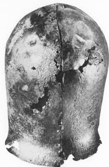
(Top left) A Chalcidian helmet found in 1956 near Ascalon, Israel, and now in the Maritime Museum, Haifa. It can be dated to the middle of the fifth century B.C. (Top right) The back of a bronze helmet made in two parts. In the Olympian Museum, Olympia, Greece. (Left) The helmet of Jerez, a Corinthian helmet found in 1938 near Jerez de la Frontera (Cádiz) and now in the Museo Municipal de Jerez, Jerez, Spain. It can be dated between 630 and 625 B.C. (Bottom left) Early Illyrian helmet found in the River Alpheus; now in the Deutsches Archäologisches Institut, Athens. (Bottom right) Helmet of Huelva, a Corinthian helmet found in 1930 in Huelva in southwestern Spain and now in the Museo de la Real Academia de la Historia, Madrid.