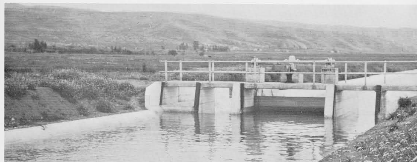
Three views of the East Ghor Irrigation Canal running along the east bank of the Jordan, which is being built through the cooperation of the Jordan Government and U. S. AID program to bring the waters of the Yarmuk down the Valley. When the canal is completed, the water, taken off in laterals, will make the fertile plain a principal breadbasket for the Hashemite Kingdom of Jordan. In the top picture can be seen some of the cuts which have exposed the ancient cities, thus enabling us to read the history of occupation.