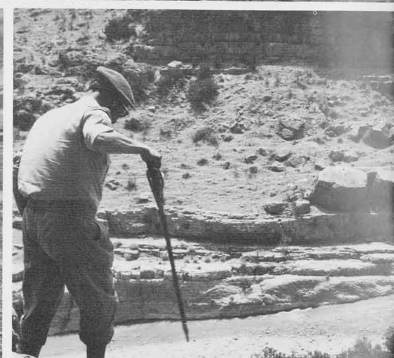
(Top) The artificial mound, Tell es-Sa'idiyeh, rises to a height of about 70 feet—all of it presumably the accumulation of centuries of building, destruction, and rebuilding on earlier ruins. (Left) Remnants of the tenth century B.C. casemate city wall are today clearly discernible and the surface is strewn with broken pottery characteristic of this period of occupation. (Right) General Karim Ohan, of the Jordan Army, who led our expedition to Tulul edh-Dhahab, the site of ancient Penuel. In the background flows the Wadi Zerqa, the River Jabbok of the Bible.