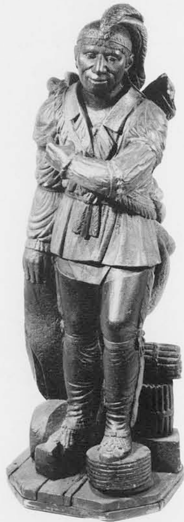
Trapper Indian. Lent by the Abby Aldrich Rockefeller Folk Art Collection. Height of figure 40 inches; with base, 42 inches. The carver of this figure, one of the few authentically modelled Indians, was more artist than craftsman and has produced a very fine piece of wood sculpture. It would appear that he had some knowledge of Trapper Indians, this one possibly a half-breed, from the area of French Canada. The leather jacket is one adopted by the Indians from the European style. However, the second arm garter and the frill at the cuff, and the sash are Victorian rather than Indian. There was another belt under the jacket which supported the loincloth and legging straps. Fringed leggings with garters, more typical of Northern Canada, and moccasins with fringed flaps are accurately shown. The band across his chest, going over one shoulder and under the other arm and attached to what is probably a cloak on his back, is similar to the Indian match coat in that it was worn in the same manner, leaving the left arm free to draw arrows and shoot. He may have held a bow or rifle in his left hand. The headdress with its dashing plumage belongs with the cuff and sash to the artist's imagination. To be credited also to his imagination is the rendering of a physiognomy so unlike the humorless, beady-eyed, and very wooden countenance of so many other wooden Indians.