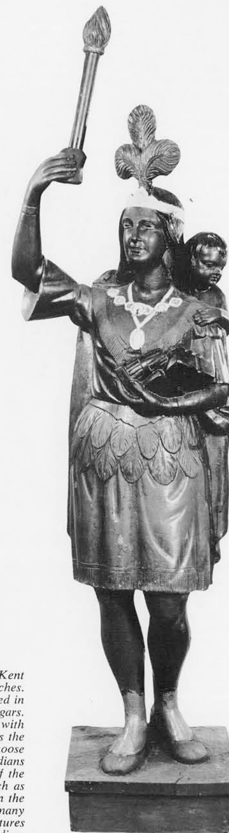
Zinc Mother and Papoose. Lent by the Atwater Kent Museum. Height 62 inches, with base 68 inches. Other versions of this figure exist, painted in different colors, and holding a bundle of cigars. The torch in fact is made of wood and inserted with screws through the fingers and thumb. Perhaps the model was cast empty-handed for the buyer to choose his own accessory. Some critics say that metal Indians lose something of the charm and individuality of the wooden version; however, once a good Indian, such as this one, was cast, it did not suffer from the incompetency of lesser carvers. Typical of many Cigar Store Indians, the facial features are more Caucasian than Indian.

The American Cigar Store Indian, as best remembered, was not part of the American scene until after the 1840's. His rise to fame would seem to coincide with the increasing popularity of the cigar and the decreasing demand for ships' figureheads. Judging from old photographs, tobacco stores became cigar (or segar) stores, and