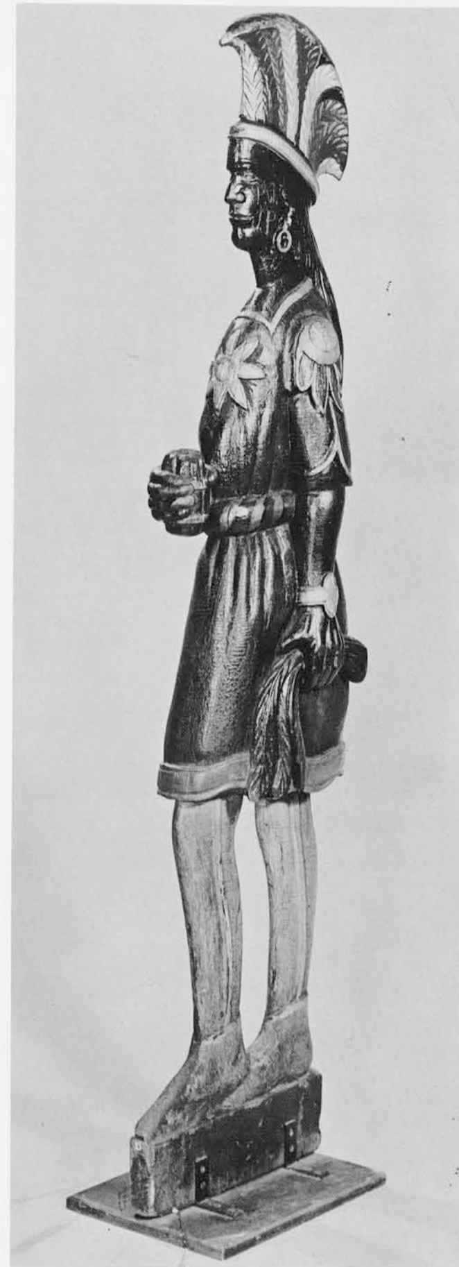
Flat Board Indian. Lent by the Virginia Museum of Fine Arts. Height 66 inches, with base 72 inches. This very rare figure was a type made for narrow doorways and easy storage. Although some of the earliest tobacco signs are said to have been flat boards such as this one, there is no way of accurately dating them. This would appear to be a superior example. The tunic of this "chief" is closer to that of a Roman centurion with epaulets and a sunburst on his chest, and the headdress is closer to a plumed helmet than anything the aboriginal American ever wore. There was a known figure of Edwin Forrest dressed as Metamora in Roman garb, so the costume was probably not uncommon. Typical of many Cigar Store Indians are the gold earrings and bracelets. The carved initials on his cheek are unfortunately typical of the ravages these Indians were forced to suffer.

But the very existence of the wooden Indian was doomed. If a new one was considered a waste of money, an old one was just an object of ridicule. Robbed of its nose, its rifle or tomahawk, humiliated by every passing dog, he became an encumbrance, no longer a glowing advertisement. With the advent of chain cigar stores such expensive advertising was unnecessary. Signs were