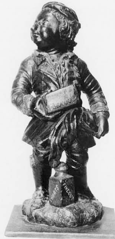
Blackamoor. In the Mercer Museum of the Bucks County Historical Society, Doylestown. This charming little figure shows an unusual combination of the round-faced darky who cultivated tobacco and the Virginia gentleman who sold it. The Blackamoor was commonly represented dressed only in a kilt and headdress of tobacco leaves or feathers, sometimes armed with a spear and shield. Compared with later American Cigar Store Indians he is a much less static figure, as he often appears about to dance. Even this figure would not be averse to taking a twirl if some one would please hold his tobacco box.

cheaper and the spirited passer-by was less tempted by a sedate sign on the store window or high overhead than by the dignified but defenseless sentinel at the store entrance. The Chicago, Baltimore, and San Francisco fires are blamed for sending the Indians of those cities to the Happy Hunting Ground. In many cities ordinances were passed against sidewalk obstructions, Indians and grocery stands being the greatest offenders. After this humiliation, the brave Indian had no choice but to repair to attics, cellars, and even city dumps. By World War I he had all but disappeared and shortly thereafter he became a collector's item. There were a few concerned souls at the time who did what they could to protect