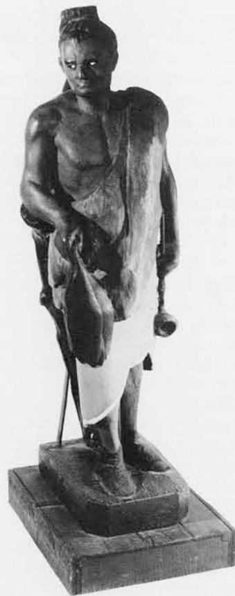
Small Indian. Lent by Mrs. E. Florens Rivinus. Height 34 inches. Typical of the age when snuff taking and pipe smoking were fashionable is this small Indian with the long pipe in one hand and the sheaf of tobacco leaves in the other. Unless it is a copy of an earlier model, it is probably pre-1840 although, later, when Indians were made life-size or larger, there was a dealer in New York who specialized in little Indians about thirty inches high.

cheaper and the spirited passer-by was less tempted by a sedate sign on the store window or high overhead than by the dignified but defenseless sentinel at the store entrance. The Chicago, Baltimore, and San Francisco fires are blamed for sending the Indians of those cities to the Happy Hunting Ground. In many cities ordinances were passed against sidewalk obstructions, Indians and grocery stands being the greatest offenders. After this humiliation, the brave Indian had no choice but to repair to attics, cellars, and even city dumps. By World War I he had all but disappeared and shortly thereafter he became a collector's item. There were a few concerned souls at the time who did what they could to protect