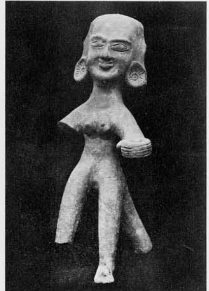
Terracotta female figurines from Bulandibagh, Patna. About 3rd century B.C.

in India even today. Their appearance from approximately the middle of the first millennium B.C. with no apparent influx of new related ideas from outside, is indicative of changing values pertaining to religious ritual.