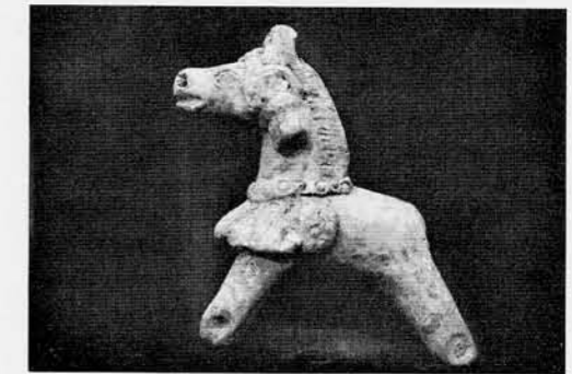
Terracotta horse from Bulandibagh, Patna. About 3rd century B.C.

One important shift in emphasis seems to be indicated by the nature of terracotta figurines. Terracottas associated with the pre-northern black polished ware phase are relatively few, cruder, and generally represent animal figures. While the terracottas of the northern black polished ware phase show a larger variety, especially outstanding are the numerous female figurines of many types. Museums in India are flooded with such figurines. The finding of some now in stratified excavations enables us to put them in a cultural context. Some of these figurines were most probably related to religious rites as is common